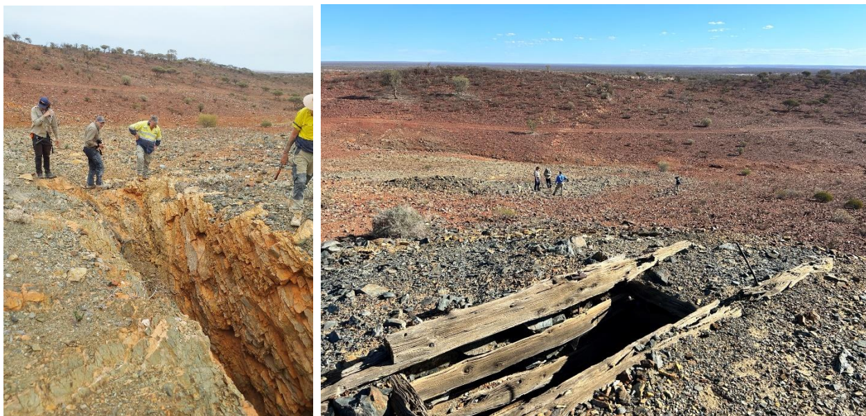
Figures 2 and 3. Asra's exploration team evaluating the ground at the Little Wonder Gold Deposit within Mt Stirling.

Mt Stirling has an existing 152,000-ounce JORC gold resource, and with nearly 14 million ounces produced in the region recently, Little Wonder is considered highly prospective for gold.