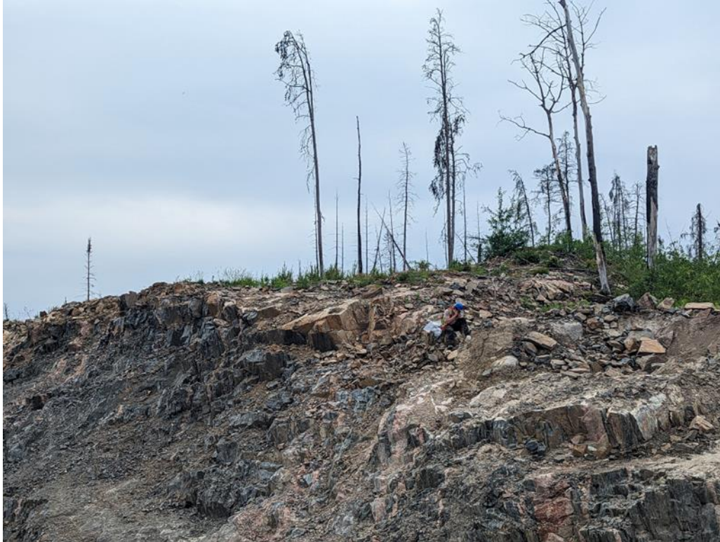
Figure 1 – HTM Sampling at Werner Lake.