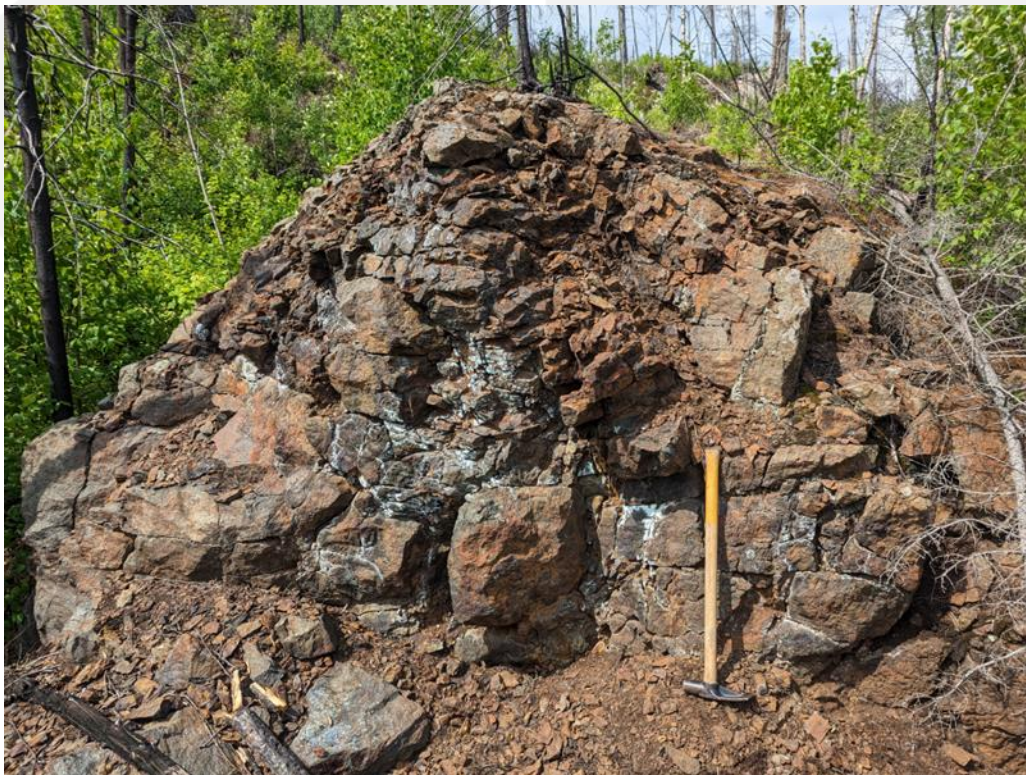
Figure 2 - Werner Lake outcrop and sampling zone