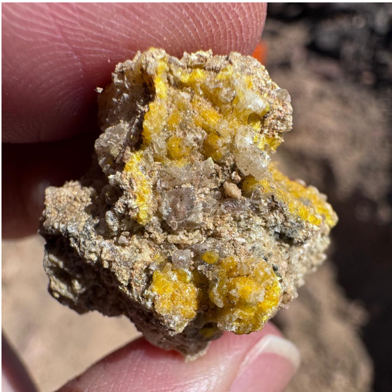
Figure 3. A field specimen of uranophane (a secondary uranium mineral) gathered from the site of sample CMRS4 at the Etango North-East Project