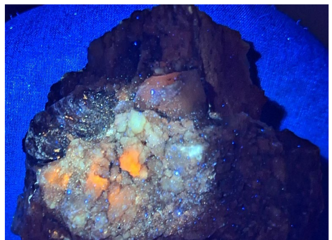
Figure 2. Mass of spodumene crystals glowing orange under 365nm ultraviolet light below reddish glowing translucent spodumene crystal.