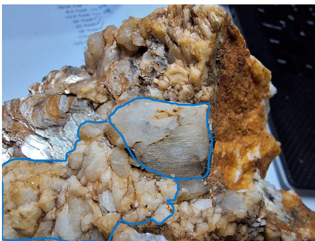
Figure 1. Translucent spodumene displaying cleavage above a mass of off-white spodumene crystals.