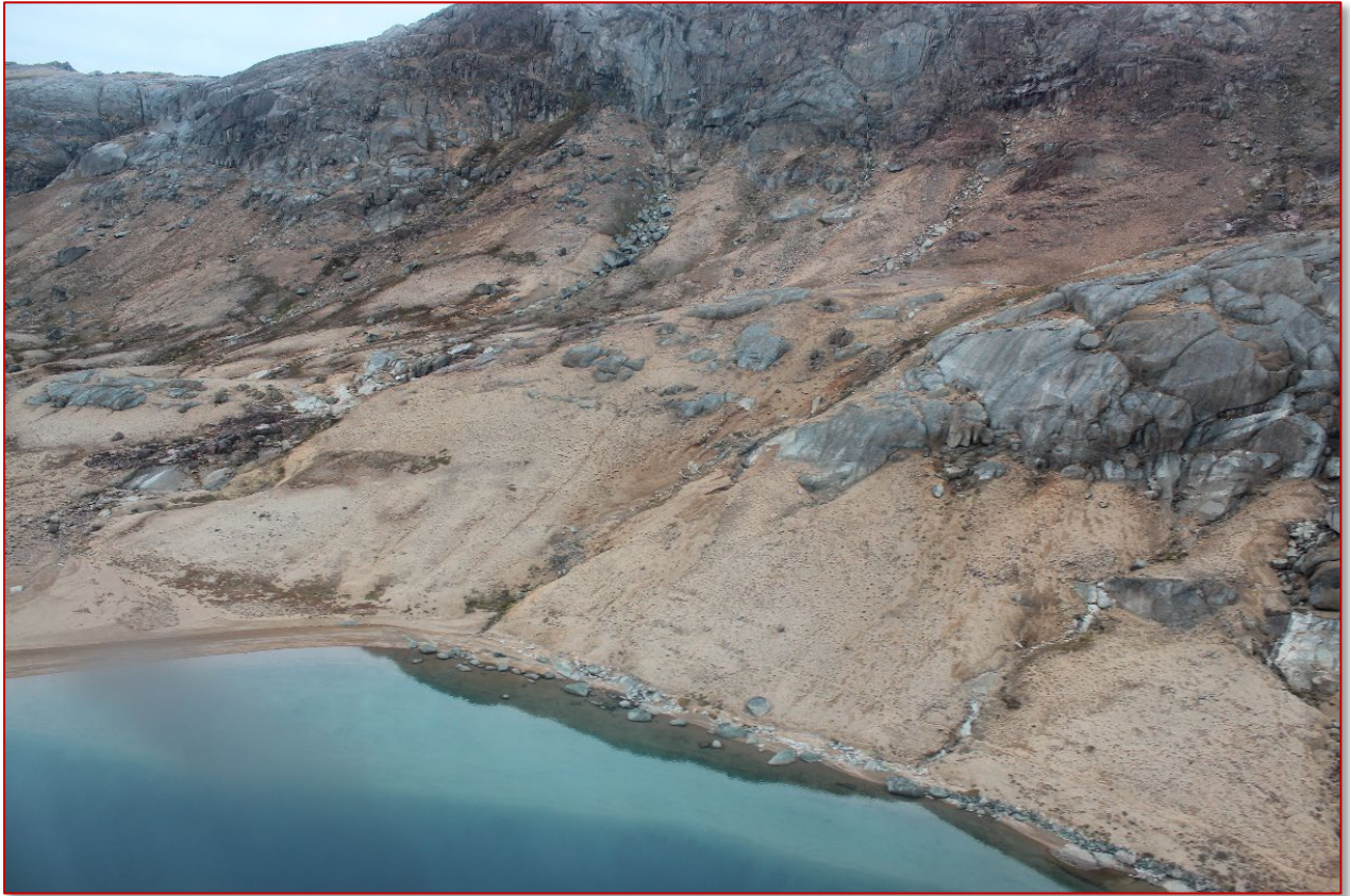
Figure 3: Colluvial and alluvial weathering accumulations from granitic country rock surrounding Blue Lake.