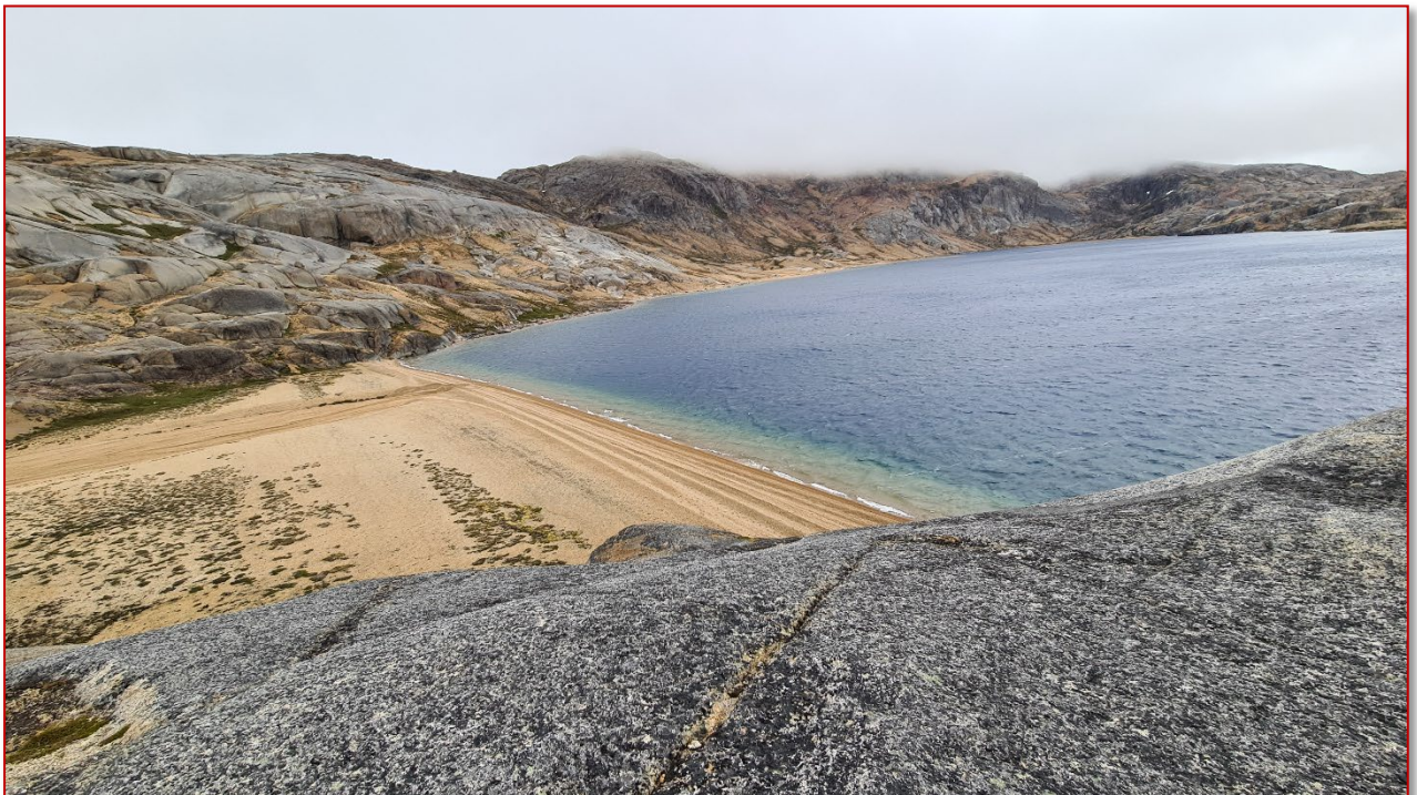
Figure 4: Coarse crystal rich 'beach' at Blue Lake.