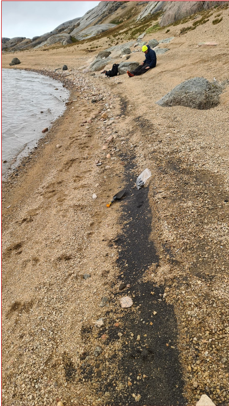
Figure 5: Grab sampling of the coarse crystal rich alluvials.