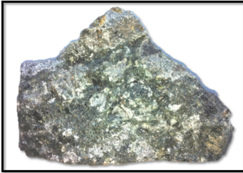
Figure 1: Brecciated Dacitic Porphyry with disseminated chalcopyrite and chalcocite from the base of the Carmelita workings (~50m below surface) on the eastern edge of Target 1. Sample assayed 3.1% Cu, 0.1g/t Au, 11g/t Ag and 200ppm Mo (Refer to ASX announcement dated 30 January 2015).