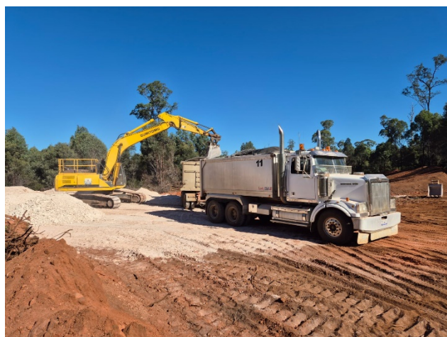
(above) test pit at the Toondoon Kaolin Project

The Company completed a test pit that produced 35 tonnes of high-grade raw ore kaolin. This is being utilised to manufacture HRM and advance commercial opportunities with the cement and concrete industry, as well as to scale up manufactured zeolite production.