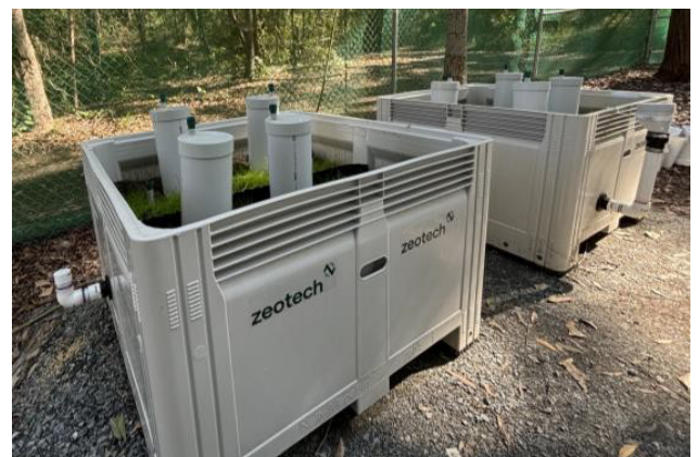
(above) simulated infield configurations at Griffith University

Following commissioning, a steady ramp-up of bio-methane production was observed; however, due to cooler seasonal conditions, the level of bio-methane production did not reach targeted levels.