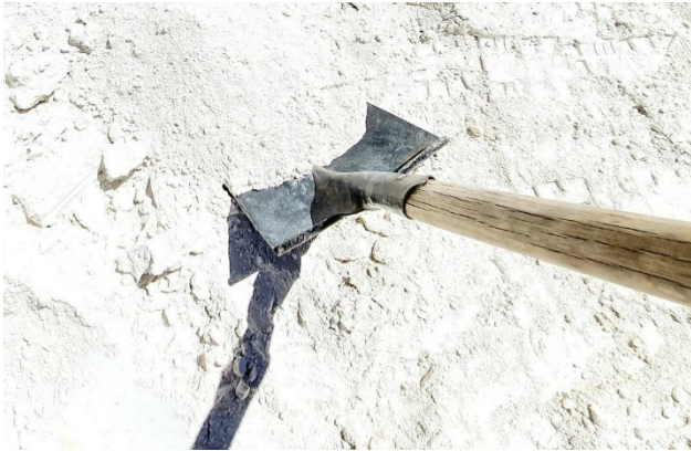
Near surface kaolin ore at the Toondoon Project

The Toondoon project's approved mining lease offers the Company a low-cost high-grade kaolin feedstock. Raw ore from the project does not need to undergo sizing (wet/dry processing) to increase alumina content and provides an immediate feedstock for HRM and manufactured zeolite production.