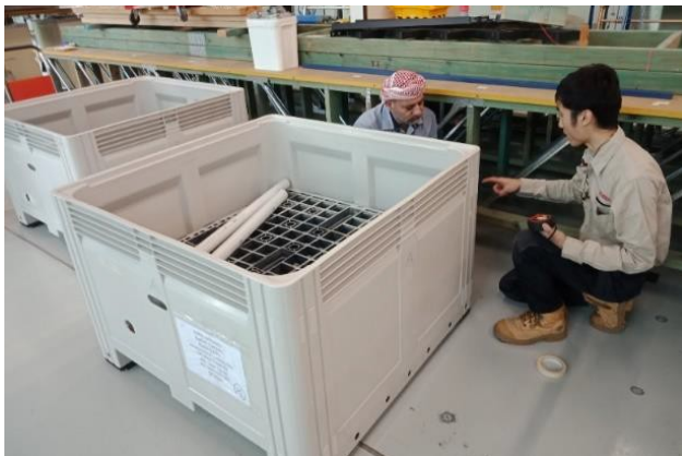
(above) simulated configuration development at Griffith University

Methane Program stakeholders agreed to progress with controlled field trials at Griffith, utilising materials sourced from a Cleanaway landfill site.