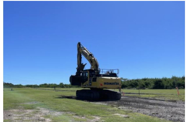
(above) landfill cover soil collection at a Cleanaway Waste Management site

constant high oxidation rates in earlier lab-scale activities during the Methane Program. A third configuration contains methanotroph inoculum only and will be used as a benchmark for the Company's products.