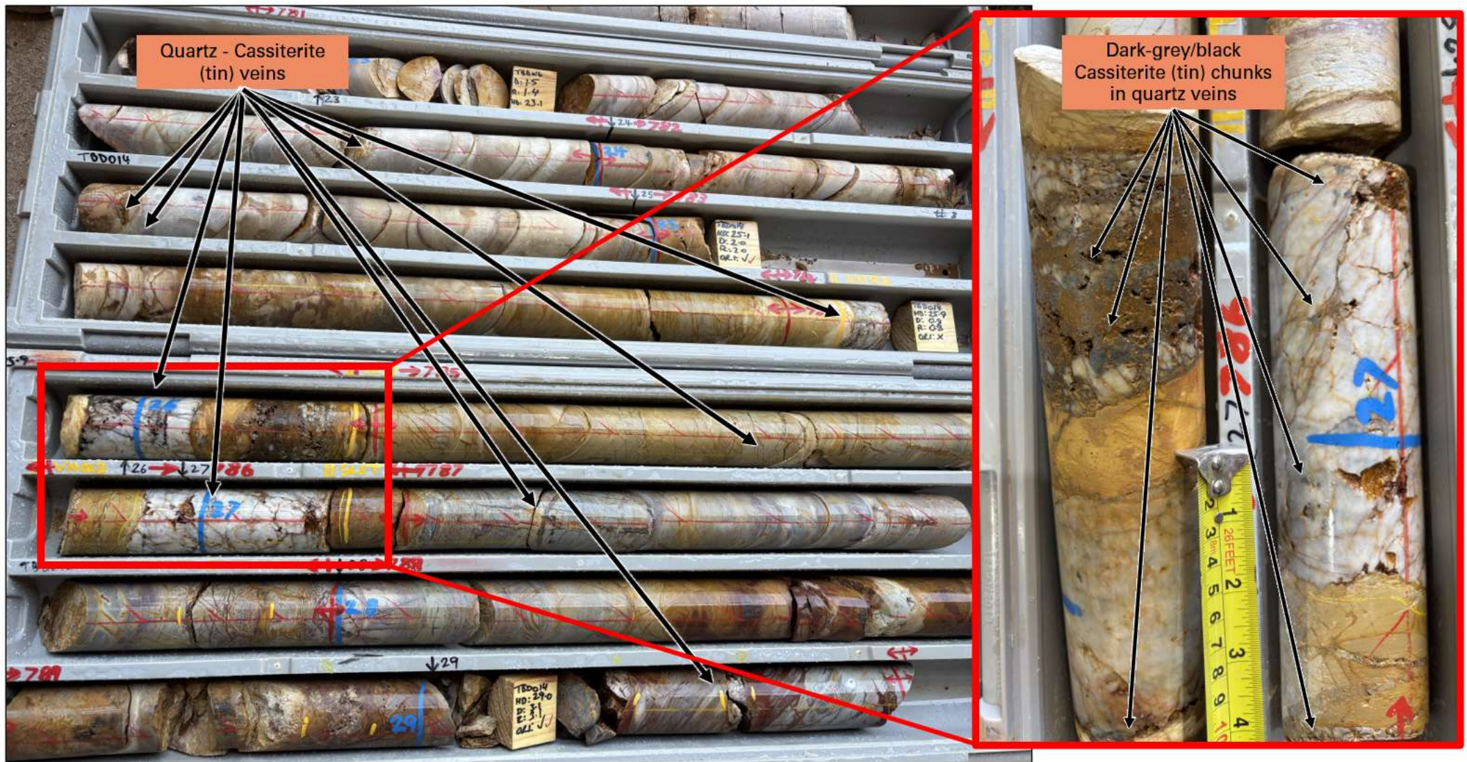
Figure 2: LHS: Photo of HQ drill core in core trays from diamond drill-hole TBD014 with multiple zones of visible quartz-cassiterite (tin) veining shown between ~23m-29.5m. LHS insert: Magnification of the strongly mineralised veins at ~26m and 27m where large cassiterite (tin) chunks are visible in the core as dark grey/black zones in quartz and iron-oxide veins. NB: Cassiterite is 78.7% tin – assays are pending.