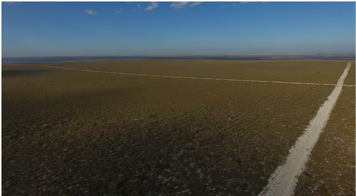
Figure 2. Suvo's 100% owned Nova Silica Sands deposit