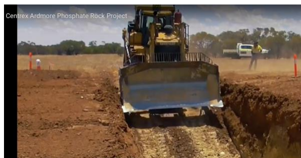
Dozer operation at Ardmore

Uncertainty regarding future phosphate prices, continues, with forecasting made more difficult because of exchange rate fluctuations, and Covid-19 related lock-downs and their impact on project construction timelines. Centrex continues to revise its DFS on the Ardmore Phosphate Project to reflect current circumstances and financial parameters.