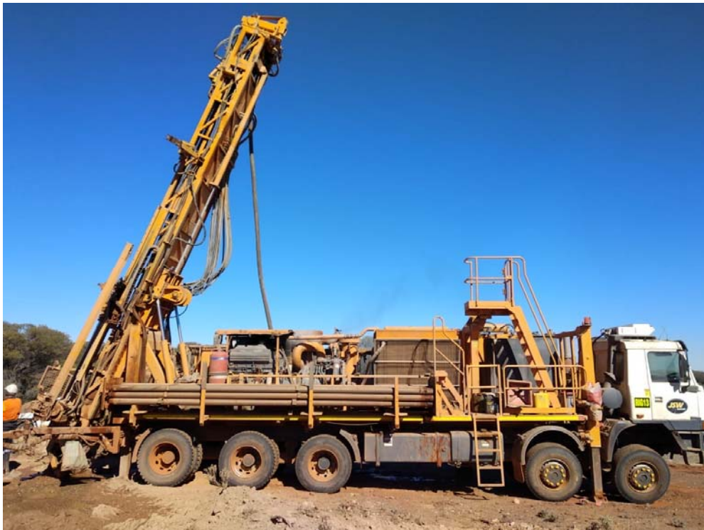
RC Drilling at the Youanmi Gold Project