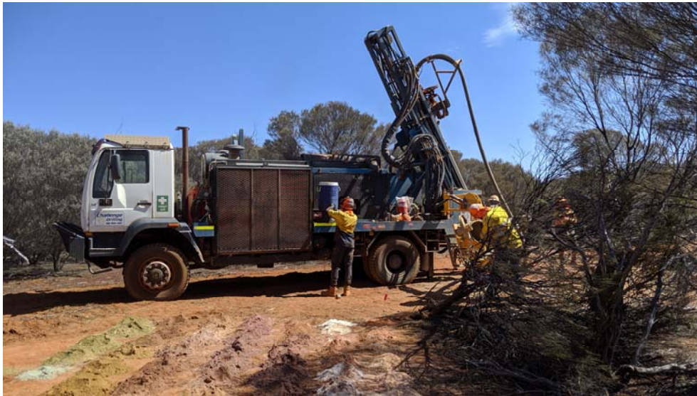
Air Core Drilling at the Youanmi Gold Project