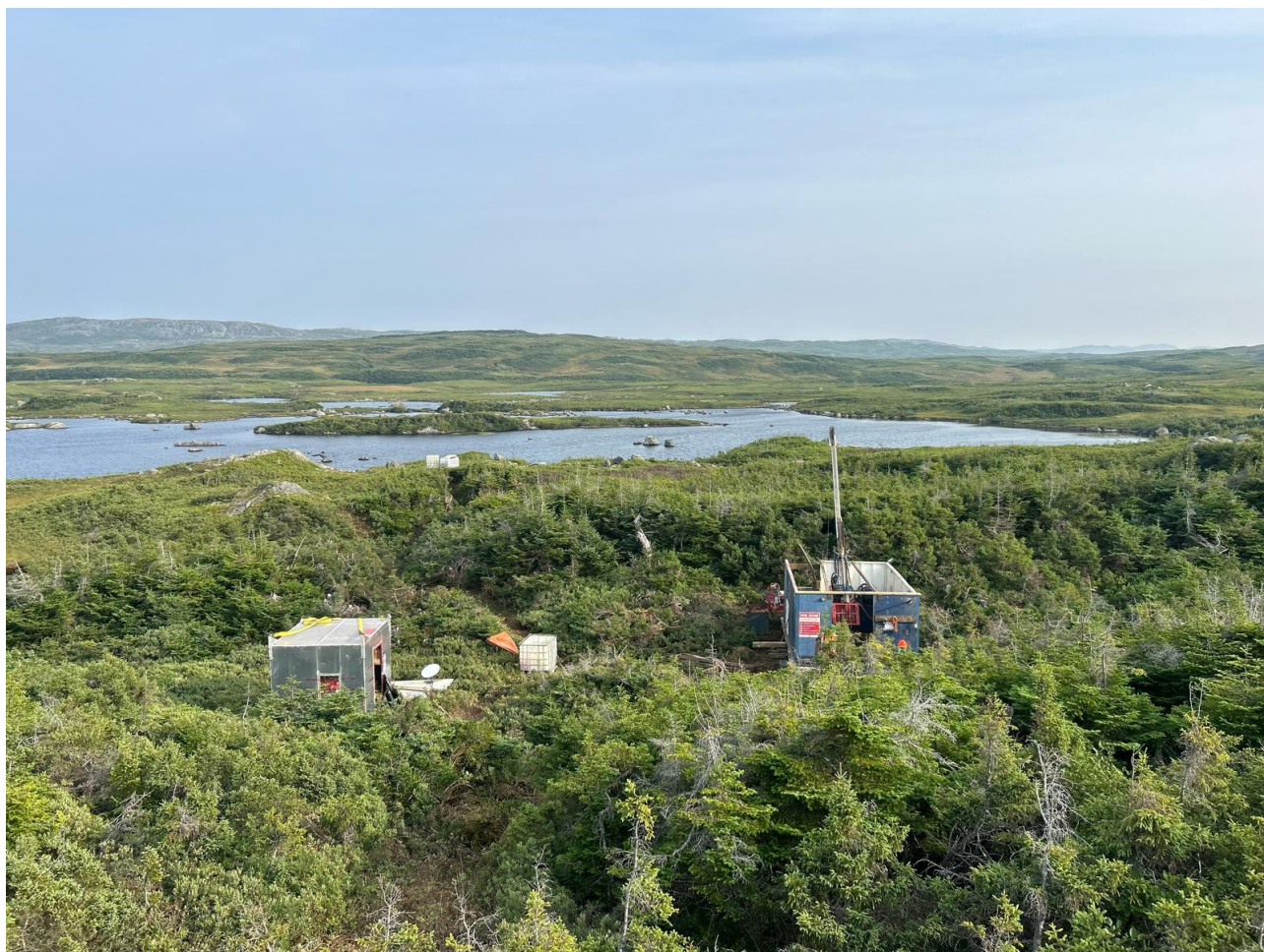
FIGURE 2: DIAMOND DRILLING AT O-2 WEST TARGET