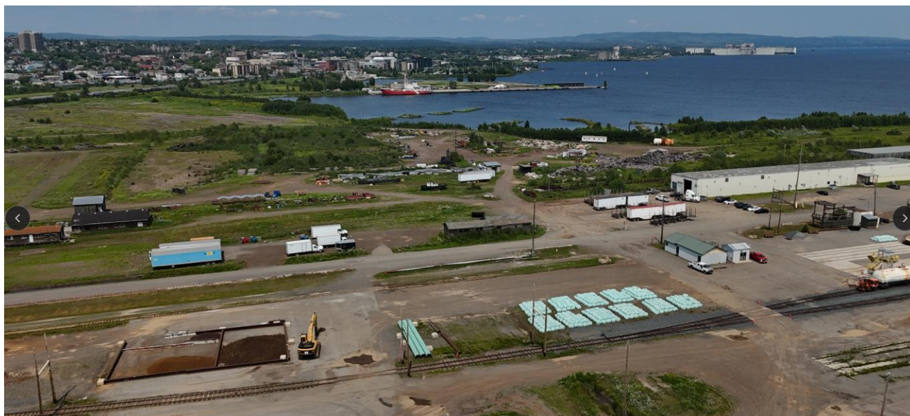
Figure 2: Mid Continent Terminal Site

Due diligence assessments for the site are now underway and is expected to be ongoing for 12 months and upon satisfactory completion the Company will look to formalise agreements with the landowner and initiate the permitting process for the site.