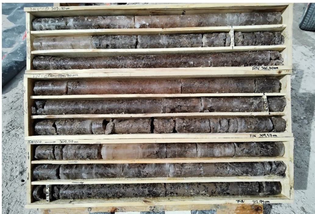
Figure 2 – DDH-1 core trays from 305-312 metres.

Following completion of DDH-1, the onsite drilling crew will relocate and mobilise to DDH-2 on the Sal Rio II tenement. The drilling of DDH-2 is expected to reach depths of 500-600m below the surface consistent with DDH-1, where drilling was significantly deeper than the existing defined JORC mineral resource depth. Pursuit is targeting a material resource upgrade in 2024, which will build on the recent maiden resource defined at the Rio Grande Sur Project. 1