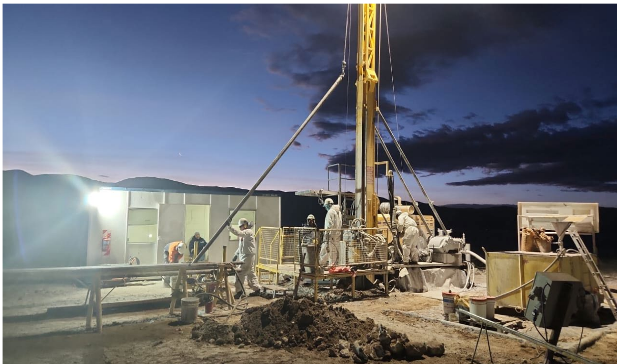
Figure 1 – Drilling crew onsite drilling DDH-1

Throughout the first several hundred metres, the on-site geologists and drilling team have been extremely encouraged by the geological units encountered. Of particular interest, at approximately 100-130m a highly porous sandy unit was encountered with Lithium brine grades substantially above expectation, based on historical drilling results. This zone has been earmarked as the potential location of a pumping well due to its heightened porosity and grade.