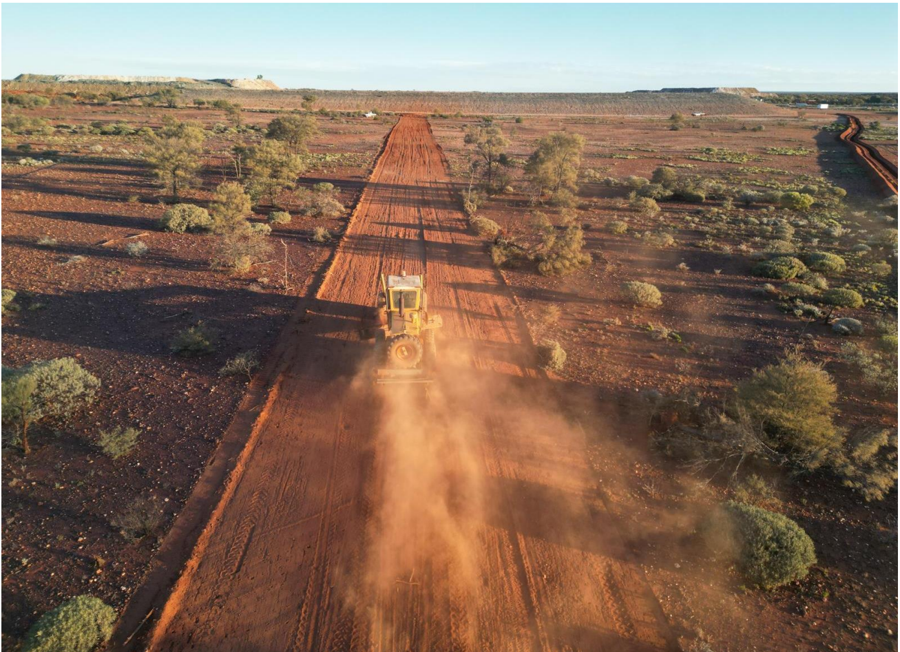
Figure 1: Haul road construction underway, July 2024.

In July approval of the mine dewatering and clearing permits for the new open pit mining area was received ( ASX announcement, 8 Jul 2024 ). In September the final approval required for development of the Murchison, the open pit Mining Proposal, was received ( ASX announcement, 4 Sept 2024 ). The Company immediately commenced construction of the accommodation village, administration infrastructure and haul road between the processing plant and the open pit mining area, allowing open pit development work to commence in advance of mining in early 2025.