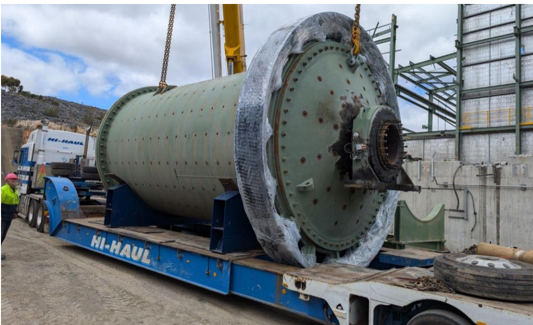
Figure 3: The 750kW ball mill being loaded for transport to the Murchison.