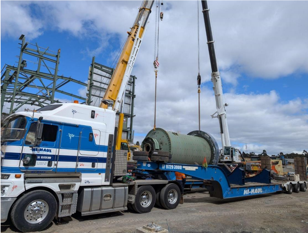
Figure 2: The 750kW ball mill being loaded for transport to the Murchison.

To expand the production plan, minimise cost and compress the delivery schedule a 750kW ball mill and associated equipment was purchased during the quarter ( ASX announcement, 15 Jul 2024 ). The 750kW ball mill is larger than the 500kW mill included in the DFS and increases processing capacity by 30% to 640ktpa. Capital cost was also reduced by 75% and lead time by 33 weeks compared to the alternative of a new ball mill sourced overseas. Relocation of the ball mill to the Murchison was completed on 13 October 2024. The Company is re-optimising the production plan for the increased processing capacity with a DFS update targeted for December 2024.