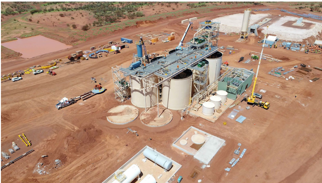
Mill and CIL tank area