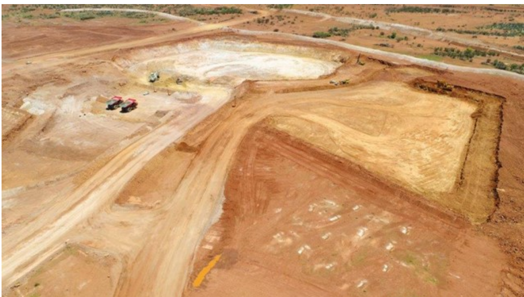
Bibra open pit