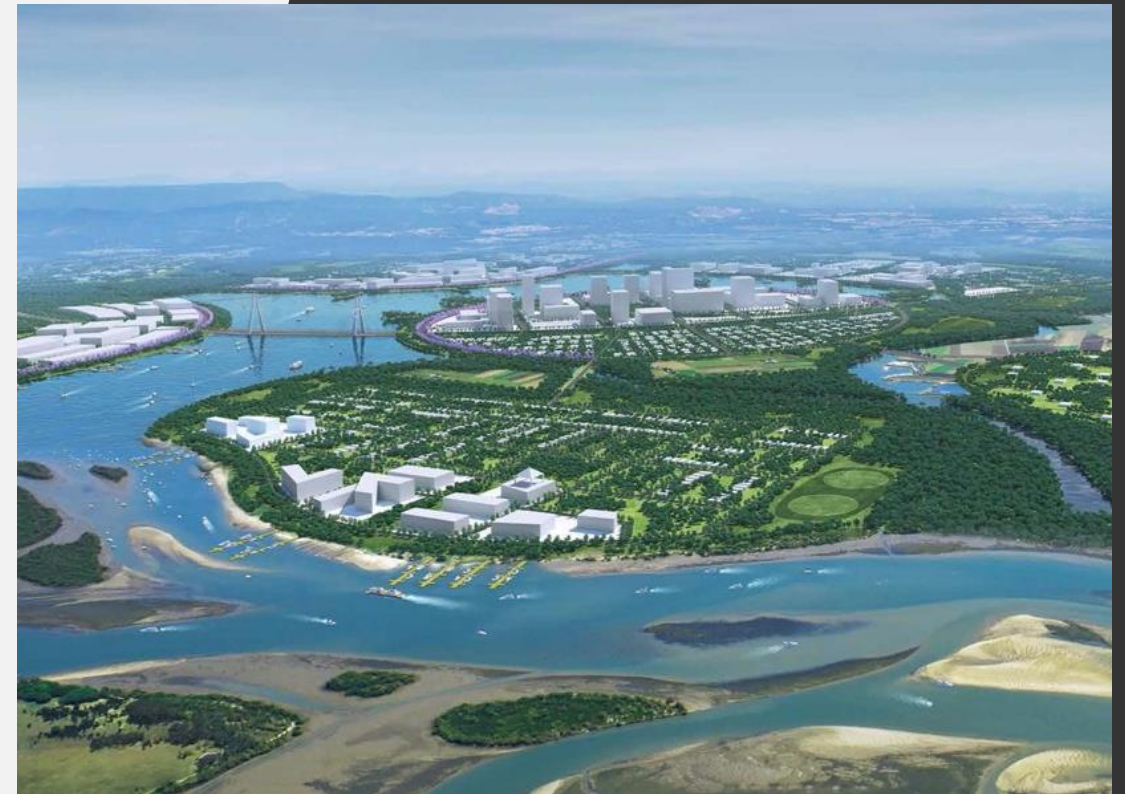
Artist impression only – not illustrative of potential development