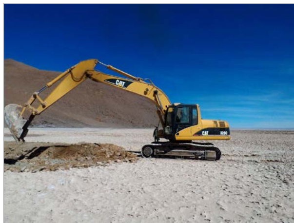
Photo 1 & 2. Rincon Lithium Project - Pablo Alurralde supervising commencement of pond construction works

The site for the initial construction works comprising two ponds totalling one hectare will be built over a period of approximately two months. Additional ponds totalling up to an extra two hectares are currently being planned, including a works plan and equipment schedule, and budget.