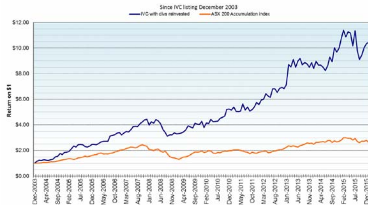
Growth of $1 in IVC with all dividends reinvested vs ASX 200 accumulation index