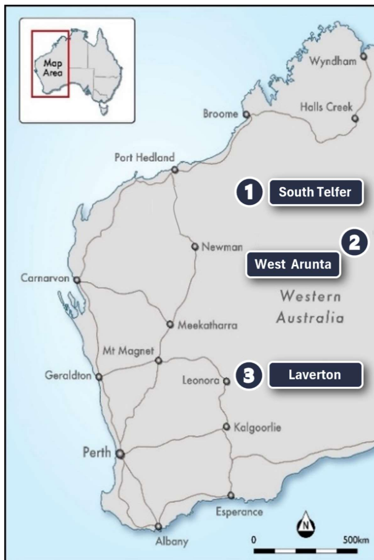
Projects Location Map