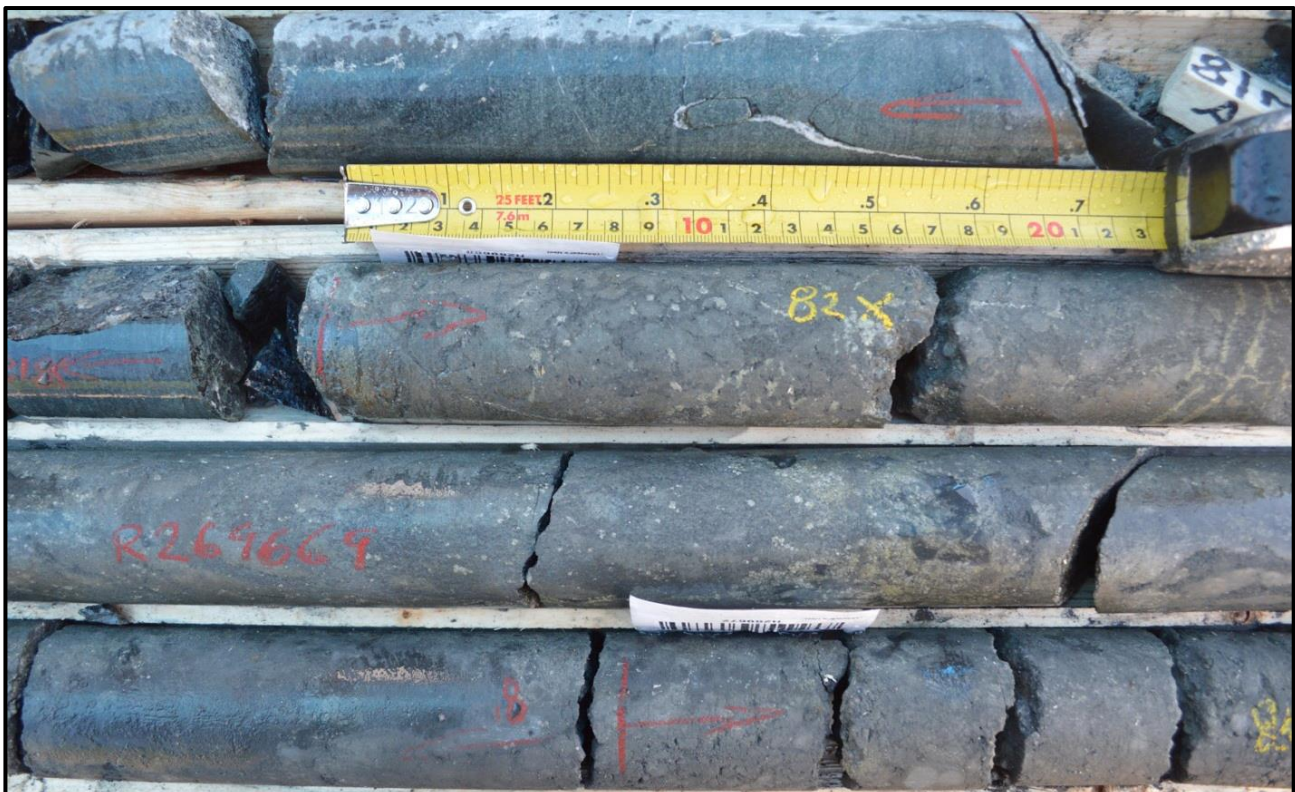
Figure 2: ZA-20-05. Massive sulphide from 81.85m downhole