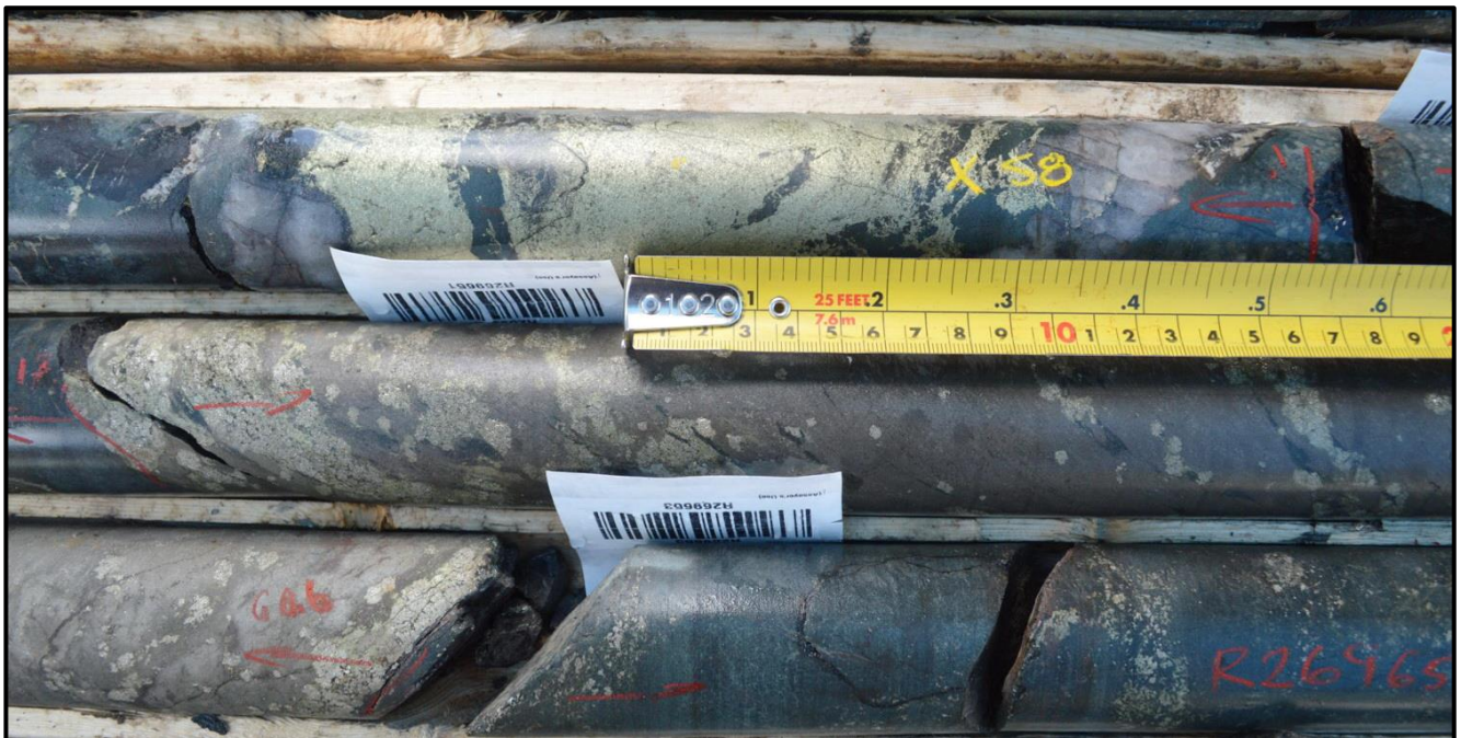
Figure 1: ZA-20-05. Massive chalcopyrite at 57.8m and massive sulphide (pyrrhotite + pyrite) at 59.2m downhole with net textured mineralisation to 62.3m downhole.