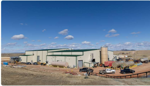
Central Processing Plant (Phase I & II)