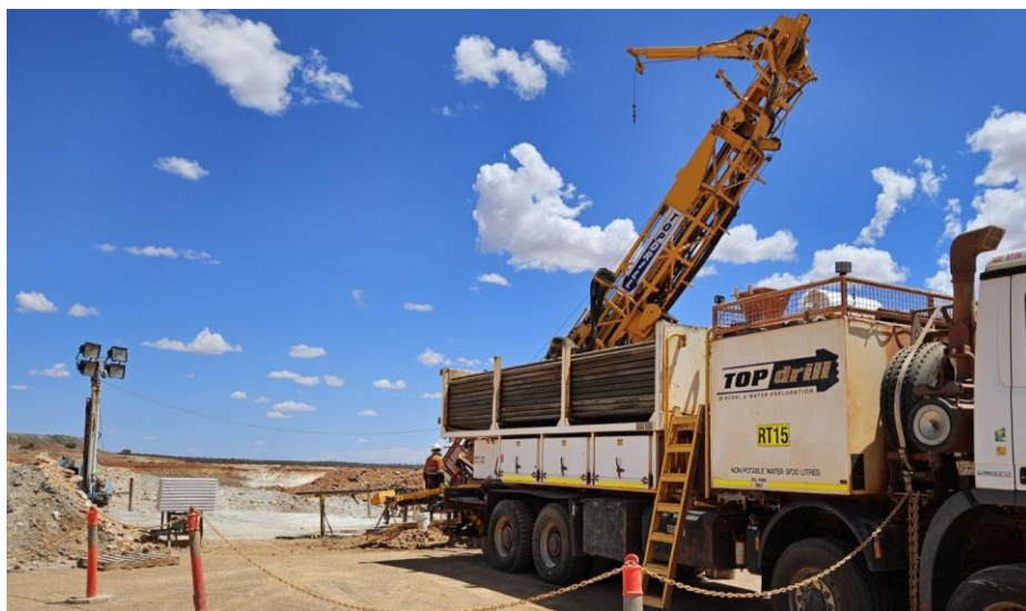
Figure 1: Diamond drilling underway at Ricciardo.

Warriedar Resources Limited (ASX: WA8) ( Warriedar or the Company ) is pleased to advise that diamond drilling has commenced at Ricciardo (previously known as Silverstone) within its Golden Range Project, located in the Murchison region of Western Australia.