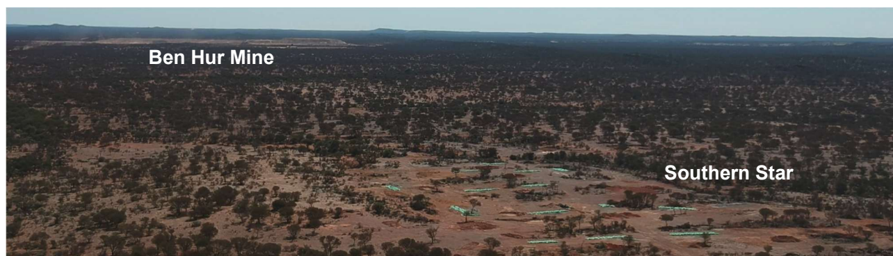
Figure 1. Photograph looking north with Southern Star drill pads in the foreground and Ben Hur mining operations in the distance.