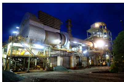
Pomalaa Ferronickel Plant