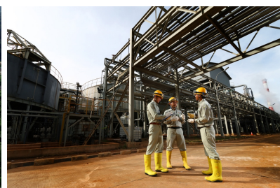
Tayan CGA Plant