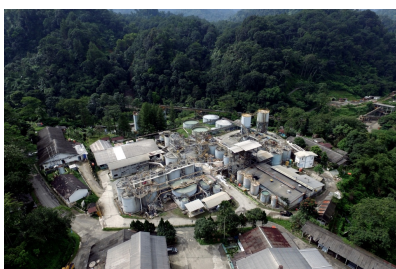
Pongkor Gold Plant