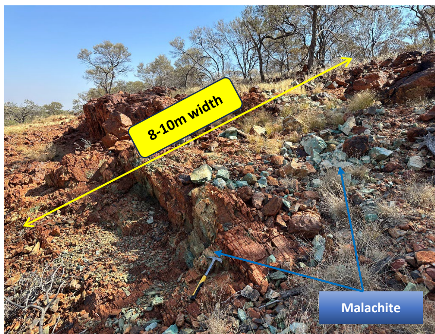
Figure 1 – Rock Chip Sample CH250 Approximately 20% Malachite and chrysocolla pervasive in rock and as stringers and joints, lower part of 8-10m copper zone