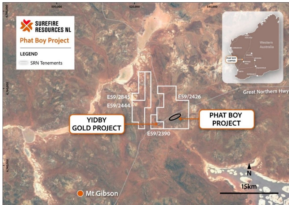
Figure 1: Location map.

All samples will be transported to the laboratory for XRF analysis, including copper, cobalt, molybdenum, and also for rare-earth elements (REE) analyses.