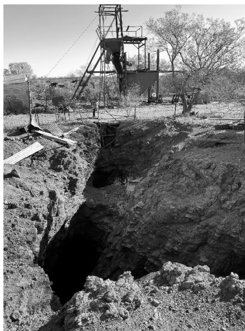
Figure 1: Image of the old ruins at the Star of Mangaroon worked between 1960 and 1983 producing ~7,464oz Au at an average grade of 34.8g/t Au.