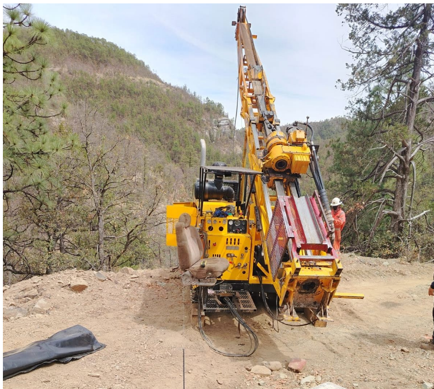
Figure 6. Diamond rig in place ahead of commencing Advance's second drill hole (YQ-25-002) at the Yoquivo Project.