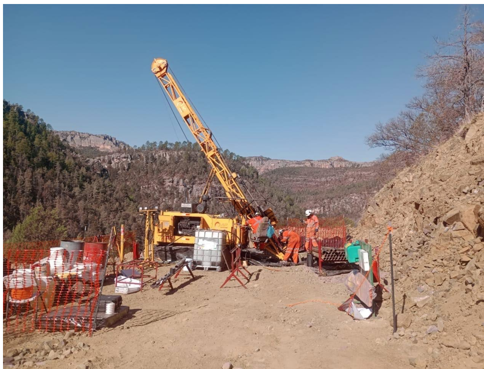
Figure 1. Photograph of the diamond rig at Yoquivo whilst drilling Advance’s maiden drill hole YQ-25-001. The hole was recently completed at a depth of 450.1m, with assay results pending.