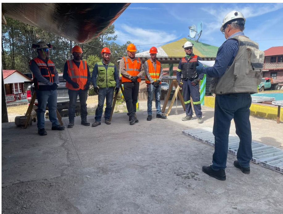
Figure 3. Safety meeting conducted with drilling contractors at Advance's core processing site in the nearby town of Basaseachi, Chihuahua, Mexico.