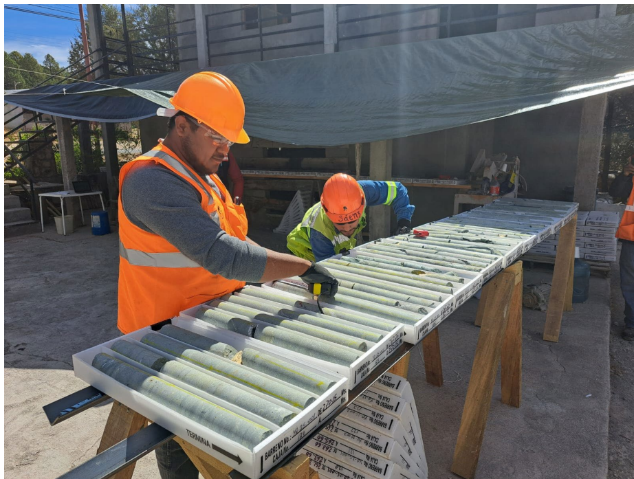
Figure 2. Geological logging of diamond core from Advance Metals' maiden hole YQ-25-001 at the Yoquivo Silver-Gold Project in Chihuahua, Mexico.

"I am very happy our first hole has been successfully completed at the Yoquivo Project. Our team and our contractors have done a great job safely setting up the drill sites and commencing the program, with valued assistance from local Yoquivo community members. This milestone means we are now moving ever closer to seeing our first high grade silver-gold assays returned from the project. Given that the full program will see up to 3,000 metres of drilling completed at Yoquivo, the coming months should be very exciting as we look to expand the already impressive endowment of silver and gold at the site."