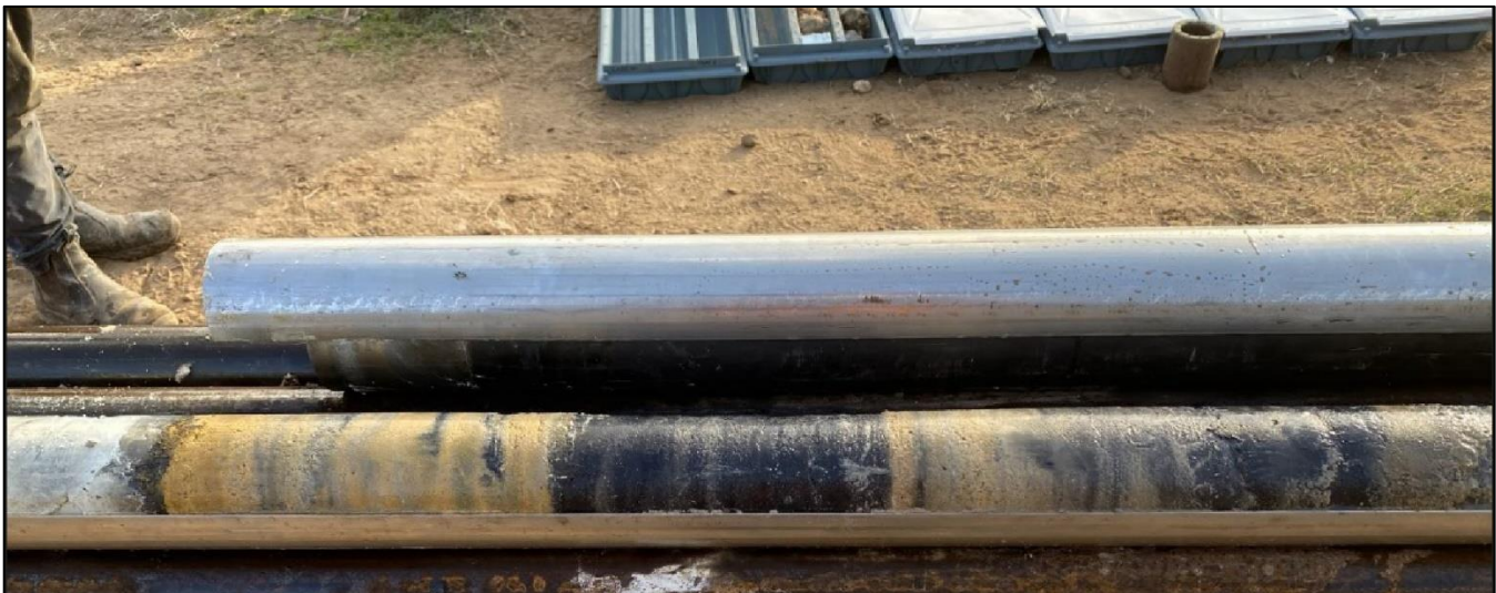
Figure 4: Cobalt in manganese oxide horizon in hole CDD001 returning 1.05m @ 0.26% cobalt, including 0.25m @ 0.83% cobalt at the base of a 12.45m interval of sediments with heavy minerals sands returning 3.28% TiO 2 from 7.1m depth.

Heavy mineral separation tests are required to quantify the heavy mineral sand potential of the sediments hosting the cobalt mineralisation at Plateau Project. Initial assay work on the diamond drilling was completed on the full sedimentary profile, and TiO 2 results have been used as a guideline to define mineralogical testwork in the heavy mineral sand profile, with significant intercepts for TiO 2 returning: