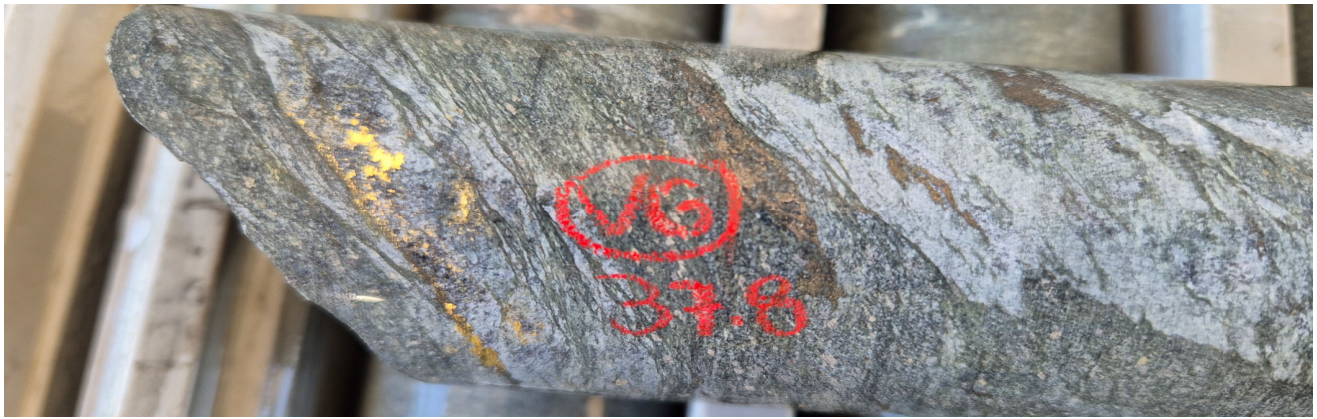
Figure 2: Core photo of visible gold from drillhole 25PGGC087 (37.8m). Trace amounts (<0.1%) of visible gold was logged within a small shear zone in the Gabbro. The shear zone was logged at being ~1m wide and the visible gold was located near the middle of the shear zone. The shear zone also contained ~5% disseminated, sheared pyrrhotite. Assays are pending for this interval and are expected in August 2025. Note: visual estimates of mineral abundance should never be considered a proxy or substitute for laboratory analyses where concentrations or grades are the factor of principal economic interest. Visual estimates also potentially provide no information regarding impurities or deleterious physical properties relevant to valuations. 13