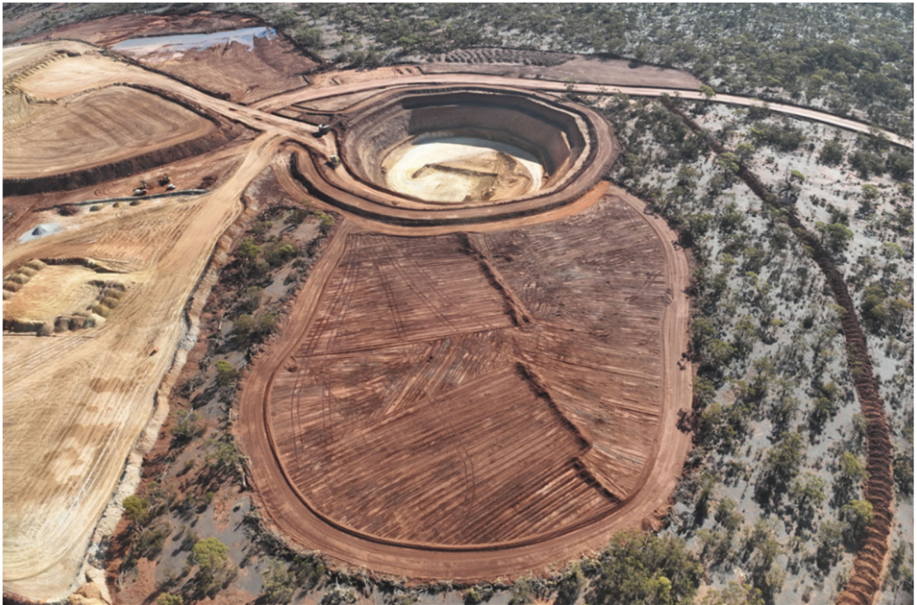
Figure 3: Boundary open pit – mining continued during the quarter