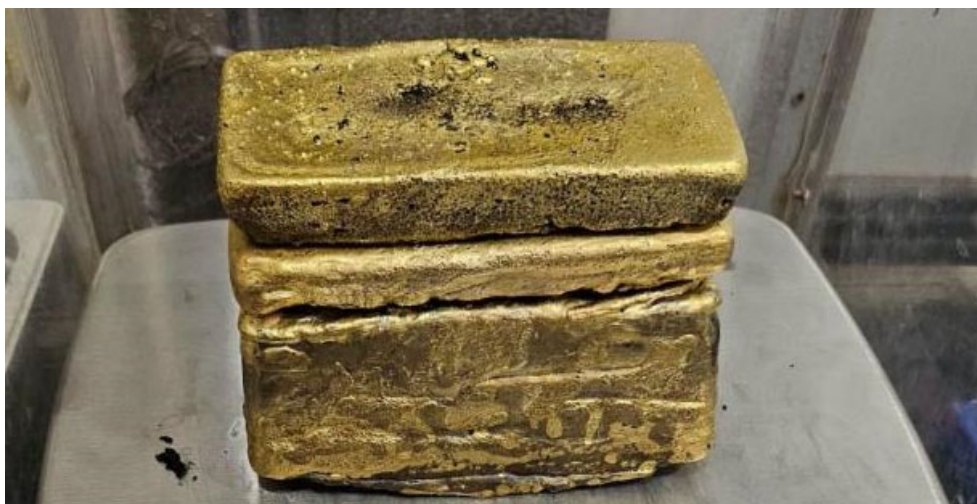
Figure 1: Paulsens weekly gold pour from late June 2025 (30,820 grams or ~990oz)