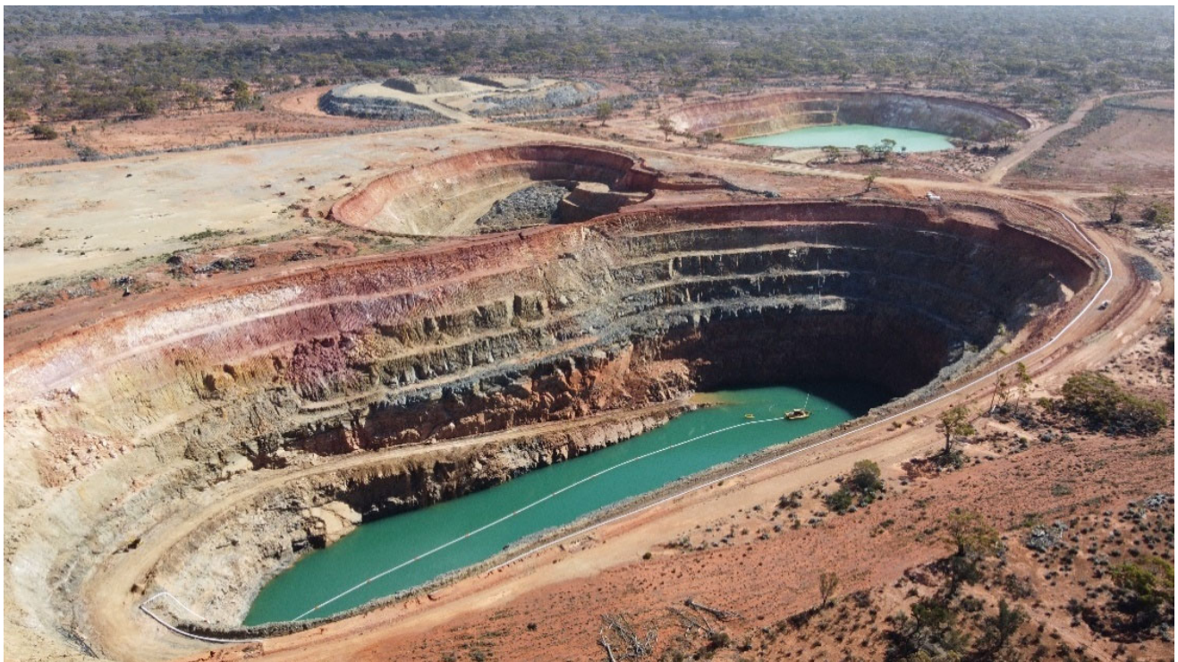
Figure 4: Majestic open pit – dewatering in preparation for a new underground mine to commence in the September 2025 quarter