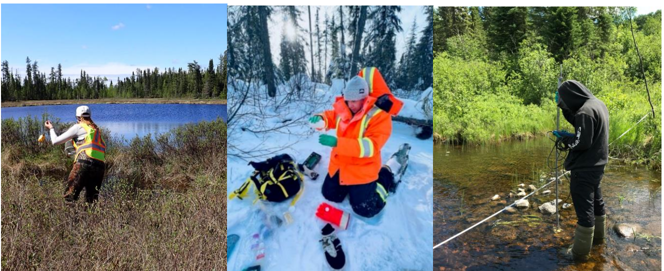
Figure 2: Baseline survey monitoring

Seymour is entering its third year of required baseline studies to determine levels of environmental risk for the permitting process and mining lease requirements.