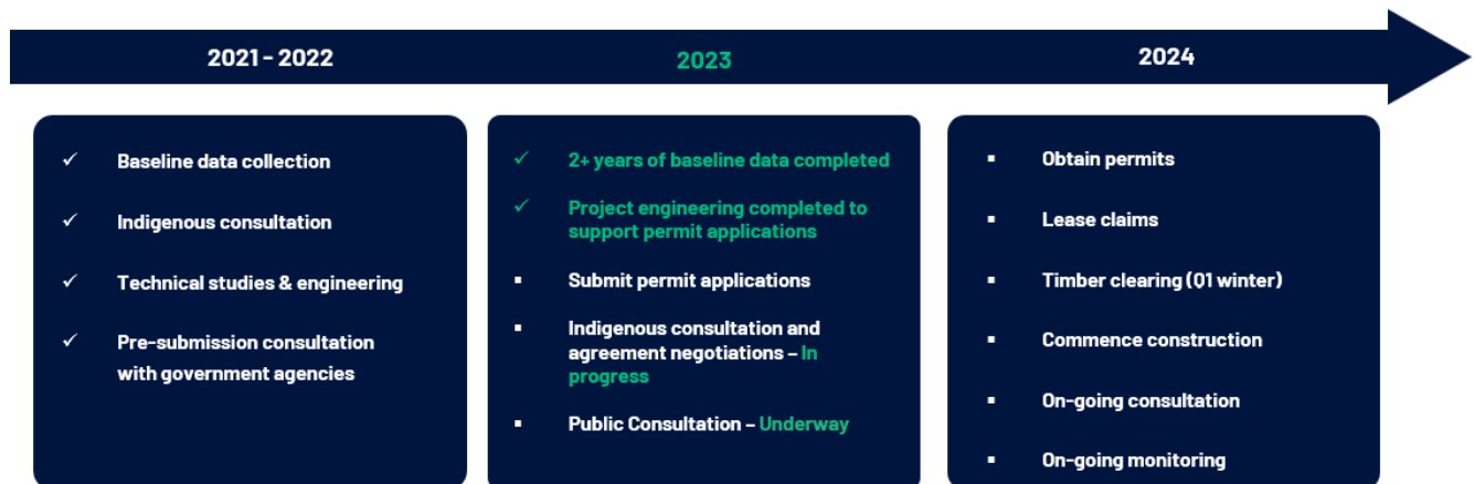
Figure 1: Seymour Permitting Timeline

The Company's strategy is to be first to market with a vertically integrated Lithium business in Ontario, Canada. Establishing an experienced local permitting team in Canada from the day of acquisition has allowed GT1 to prepare for all upcoming formal permitting requirements that are now underway and allowed GT1 to achieve significant milestones leading up to the formal permitting process.