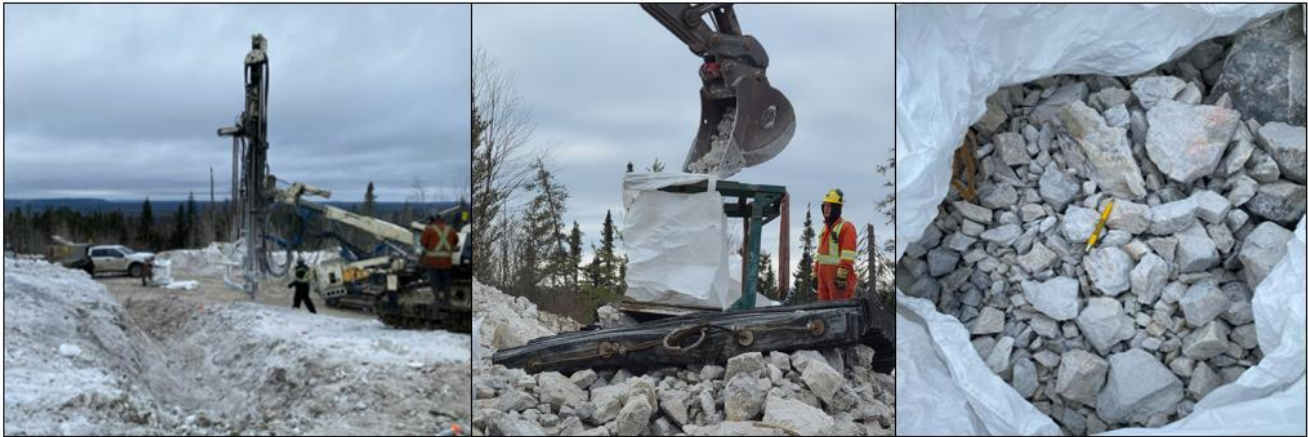
Figure 4: Bulk sample North Aubry for Hydroxide pilot test work in Saskatchewan

Collection of a 99t bulk sample of LCT pegmatite has been completed at Seymour. The sample has been extracted from pegmatite outcrop and transported to the Saskatchewan Research Centre in Saskatoon, Saskatchewan for metallurgical pilot test work. The test work will seek to optimise the lithium converter process earmarked as part of the integrated project study.