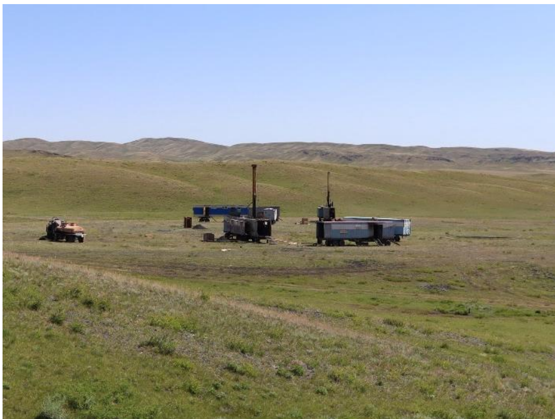
Figure 1 – Reserve definition drilling underway in the Central Graphite Zone, May 2025.