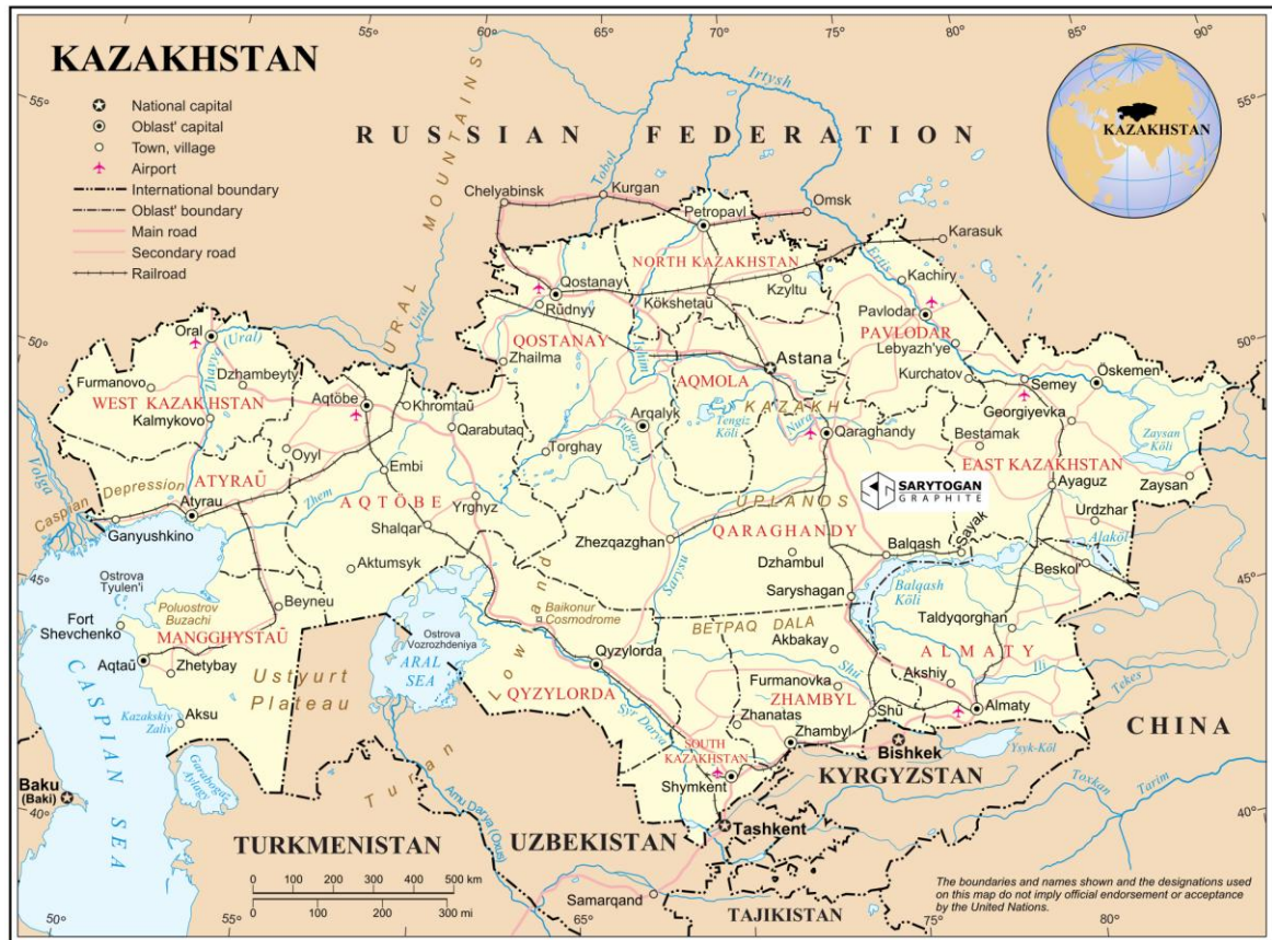
Figure 3 - Sarytogan Graphite Deposit location.

The Sarytogan Graphite Deposit is in the Karaganda region of Central Kazakhstan. It is 190km by highway from the industrial city of Karaganda, the 4th largest city in Kazakhstan (Figure 3).