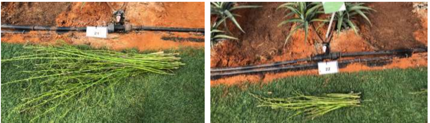
Image 1: Heated asparagus on the left with the control crop shown right

The Asparagus fruits were heated in two heating levels: heating to around 22c° to 24 c° using an hybrid system, a fusion of a ground source heat exchange (GSHE) and a heat pump and heating to around 26 c° to 28 c° using GSHE only.