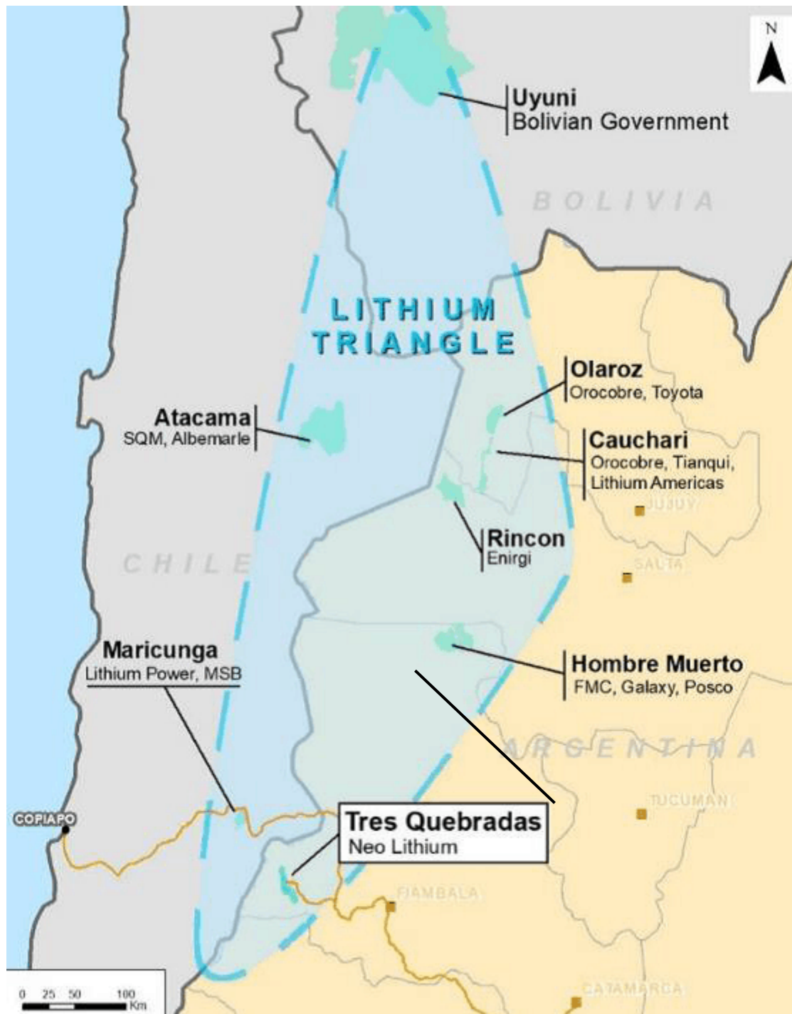
Figure 1: The Lithium Triangle

Xantippe looks forward to updating on its progress in Bolivia, including the introduction of potential technology partners to complement its growing and strategic land position in Catamarca, Argentina.