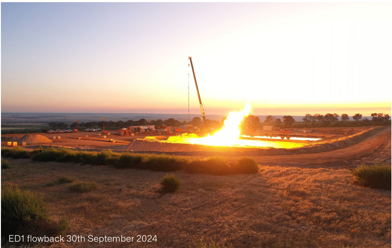
ED1 flowback 30th September 2024

Whilst positive, these initial observations are preliminary in nature and the well test outcome remains subject to the results of the full flow test program. Strike will provide the final results of the flow testing program at its conclusion.