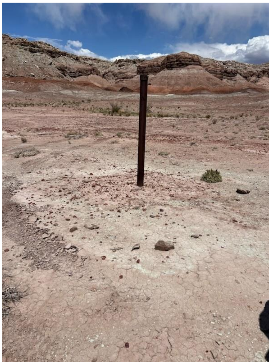
Figure 2: Photo of the Mt Fuel-Skyline Geyser drill pad showing minor work necessary to re-establish the drill pad.

The fractured rock of these units forms an excellent reservoir for supersaturated brines. Due to the presence of the above attributes, when brine is removed at an extraction point it may flow into the voids from where it was removed. This would assist in maintaining high reservoir pressure and help deliver a high ultimate recovery of brine.