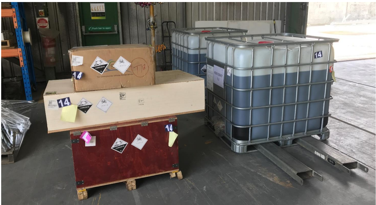
Figure 1 CEC 5kW/30kWh VRFB package with vanadium electrolyte ready for assembly and testing at CADDs Group