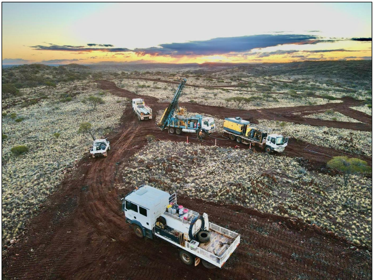
Figure 1. Challenge Drilling RC rig at Thylacine