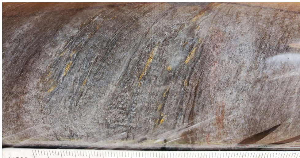
Photo 1: Visible gold grading 124 g/t at 1236m down hole in TAN20-DD239

"Two drill holes are in progress at 330m and 980m respectively and need to be completed and assayed before resources can be updated for M1 South. Reporting of resources, reserves and the life of mine production profile for Sanbrado originally scheduled for release in Q4 2020, will now be released in Q1 2021 to allow the current drilling program to be completed and any further results to be included."