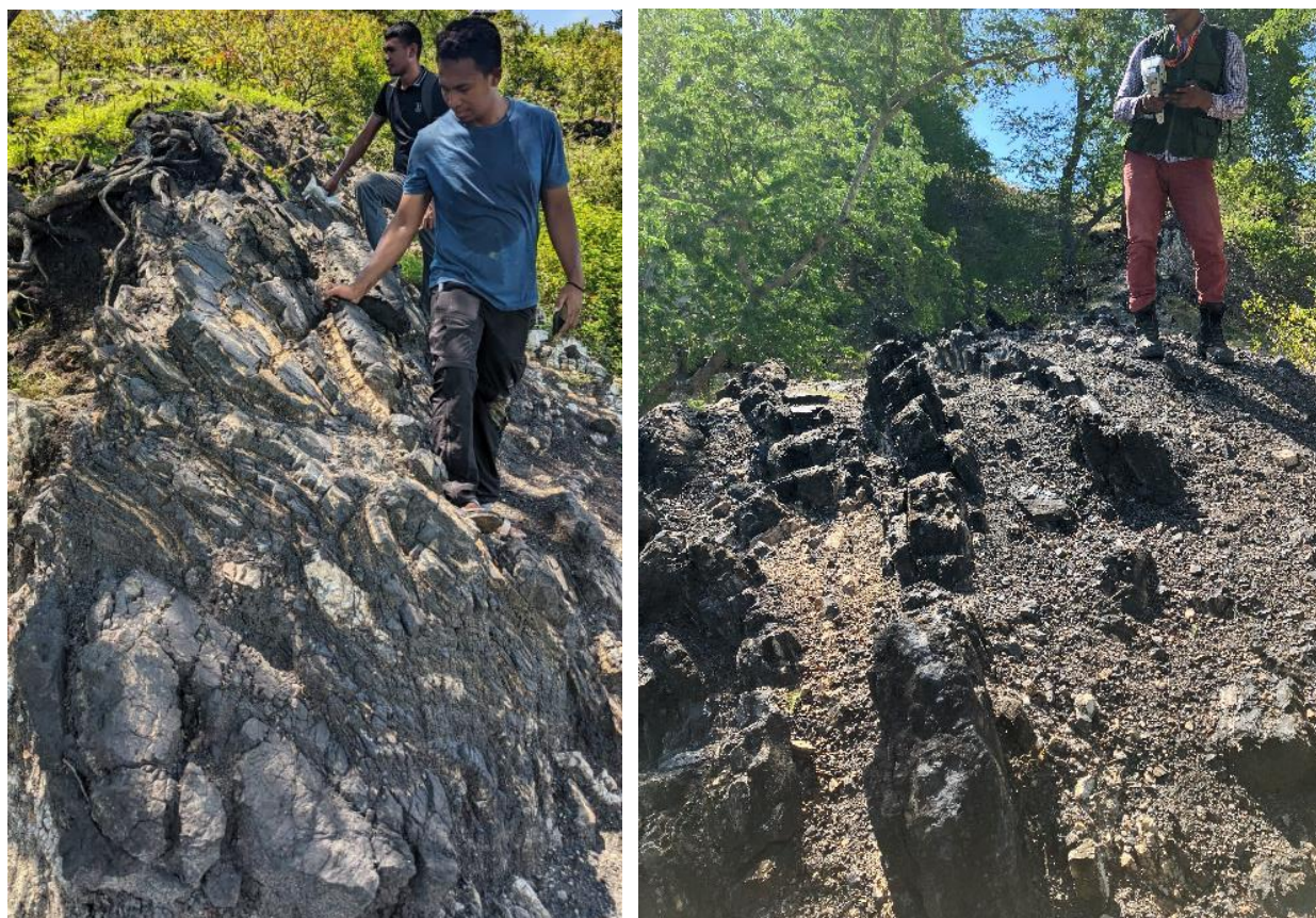
Figure 2: Estrella Geologists mapping outcropping bedded chert and manganese exhalative horizons with supergene enrichment and abundant manganese mineralisation estimated at greater than 60% iron-manganese oxide.

Estrella Resources Limited (ASX: ESR) (Estrella or the Company) is pleased to announce that it has applied for four additional highly prospective Exploration and Evaluation Licenses covering 194.425 km 2 within the Baucau Municipality of Timor-Leste. The additional licenses will take Estrella's total landholding to 698 km 2 if granted and initial reconnaissance has defined some of the best outcropping manganese mineralisation seen to date within Estrella's tenure.