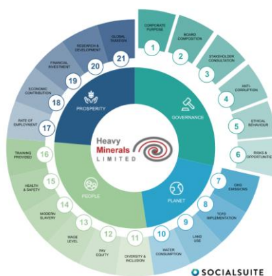
Figure 2: World Economic Forum Governance Metrics

Heavy Minerals Limited (HVY) remains steadfast in its dedication to ESG principles and sustainability, recognising them as essential drivers for long-term value. The Company has been working with Socialsuite and has selected the United Nations' Sustainable Development Goals (SDGs) as appropriate standards to align with. In 2023 work commenced to complete a baseline assessment against the Stakeholder Capitalism Metrics (SCM) framework established by the World Economic Forum (WEF). The baseline assessment is well advanced, and the Company is progressing towards establishing an ESG disclosure report against the 21 WEF metrics in due course.