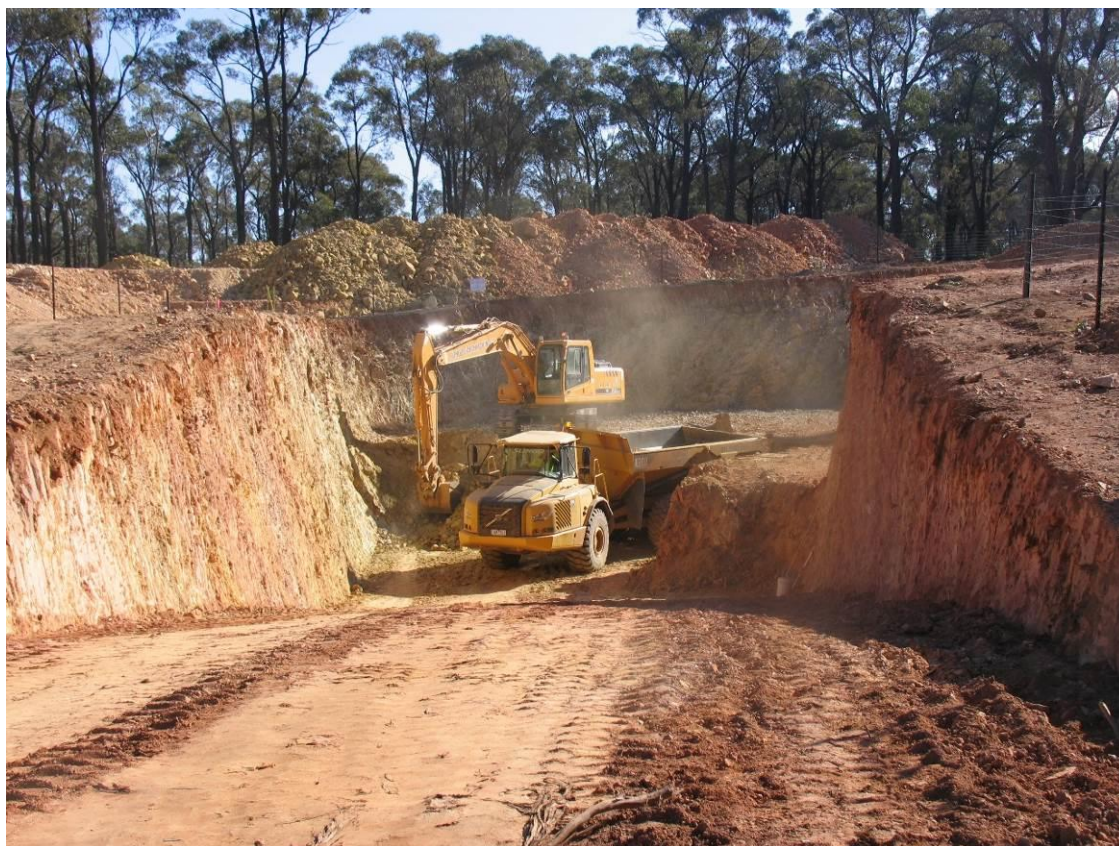
Figure 3: Harvest Home Open Pit Mine