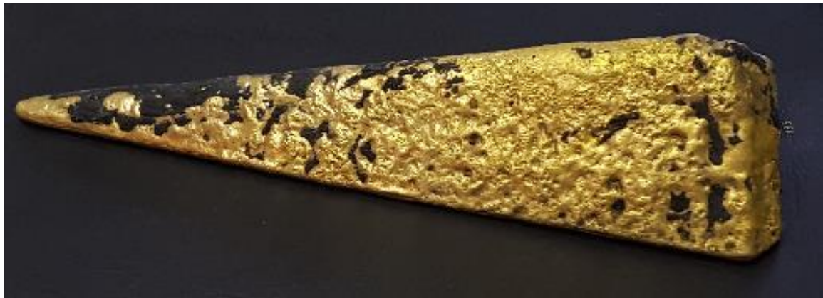
1.944kg Gold Dore Bar

The gold processing plant was designed to recover most of the gold by gravity methods. Gold is captured in items of the plant used in the process. The plant has been thoroughly cleaned and the gold captured has been recovered and poured into the 1.94kg Dore bar pictured below.