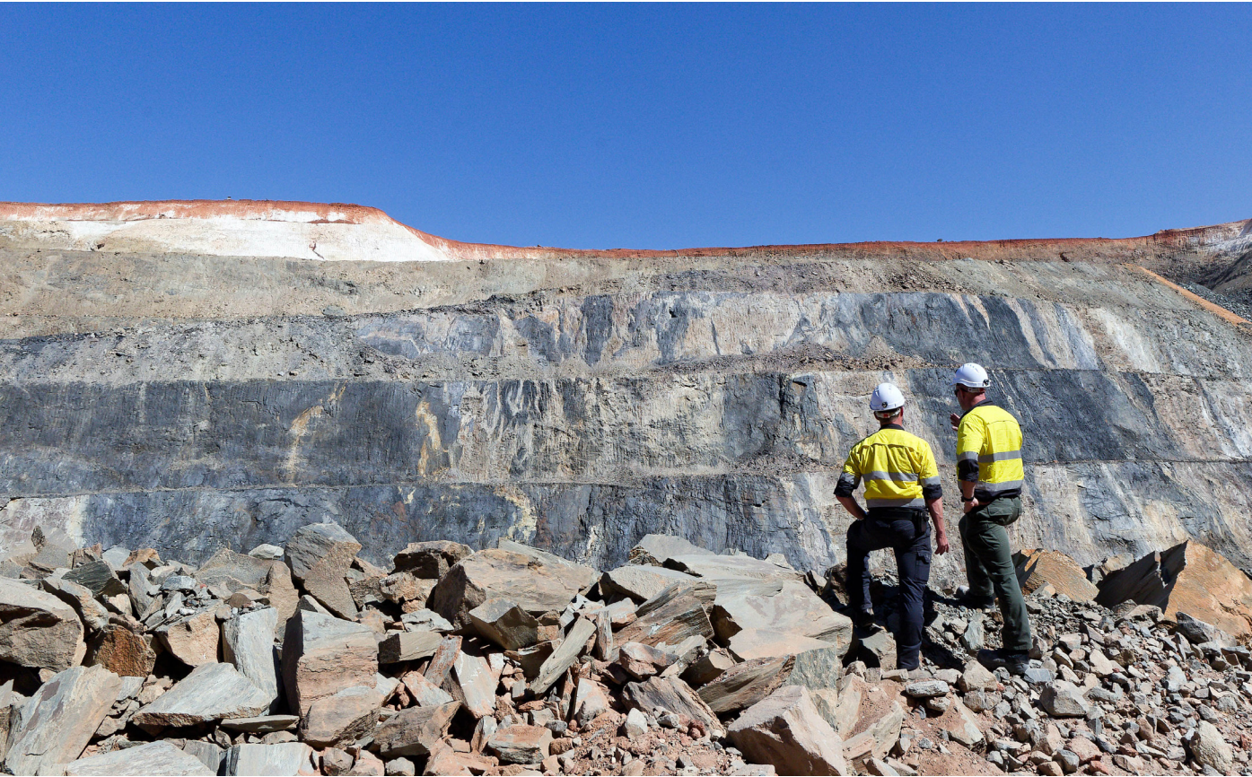
Spartan personnel over looking the Gilbey's Pit.