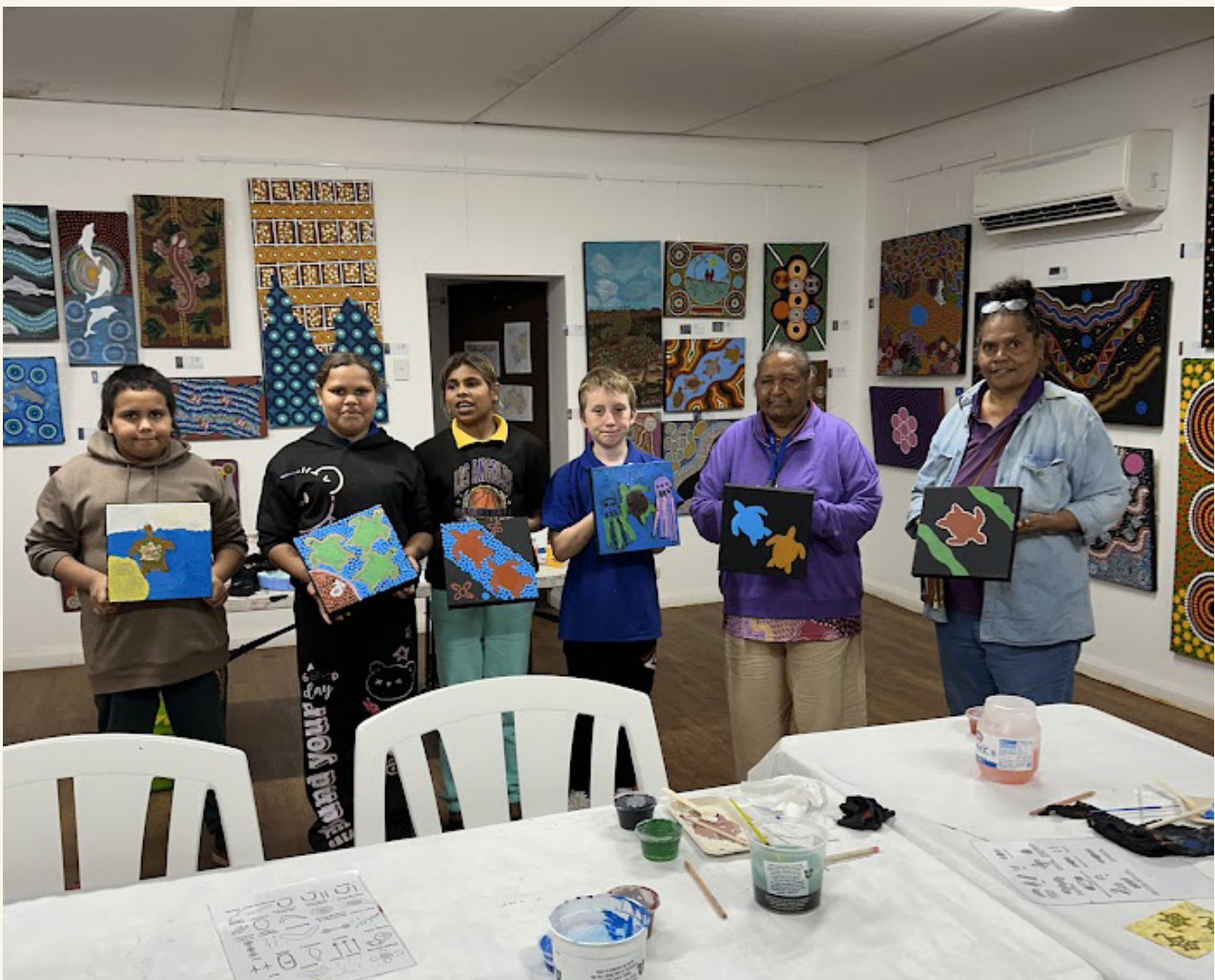
Mount Magnet School students displaying their artwork.

To allow our employees and visitors to appreciate these Artists works, Spartan commissioned Wirnda Barna Artists to produce 12 paintings, depicting the land and environs in and around the Dalgaranga Gold Project. These paintings are now displayed at the Dalgaranga mine site and the Spartan head office in Perth. Spartan looks forward to continuing its support of the Wirnda Barna Art Centre.