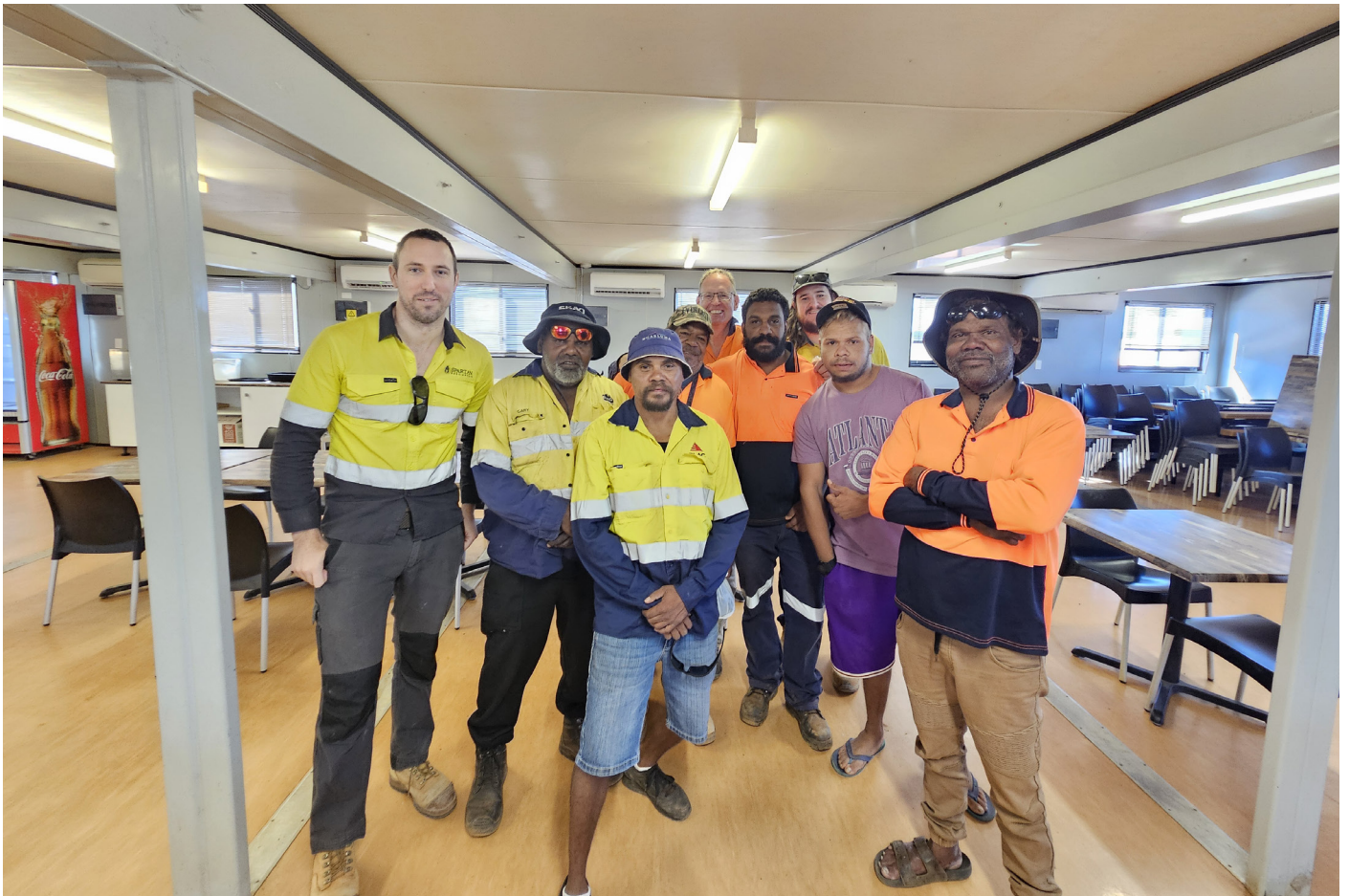
Traditional Owners and Elders of the Badimia Aboriginal Corporation attending a Heritage Survey at the Dalgara Gold Project in March 2024.

An inaugural Cultural Awareness Training Program for Spartan employees and contractors with Elders of the Badimia Aboriginal Corporation has been agreed and will commence in late calendar year 2024. Spartan looks forward to commencing this program and the benefits it will bring in strengthening our understanding of methods to further ensure cultural values are protected where they are present. Our target is to have the majority of Spartan employees partake in this program during FY2025.