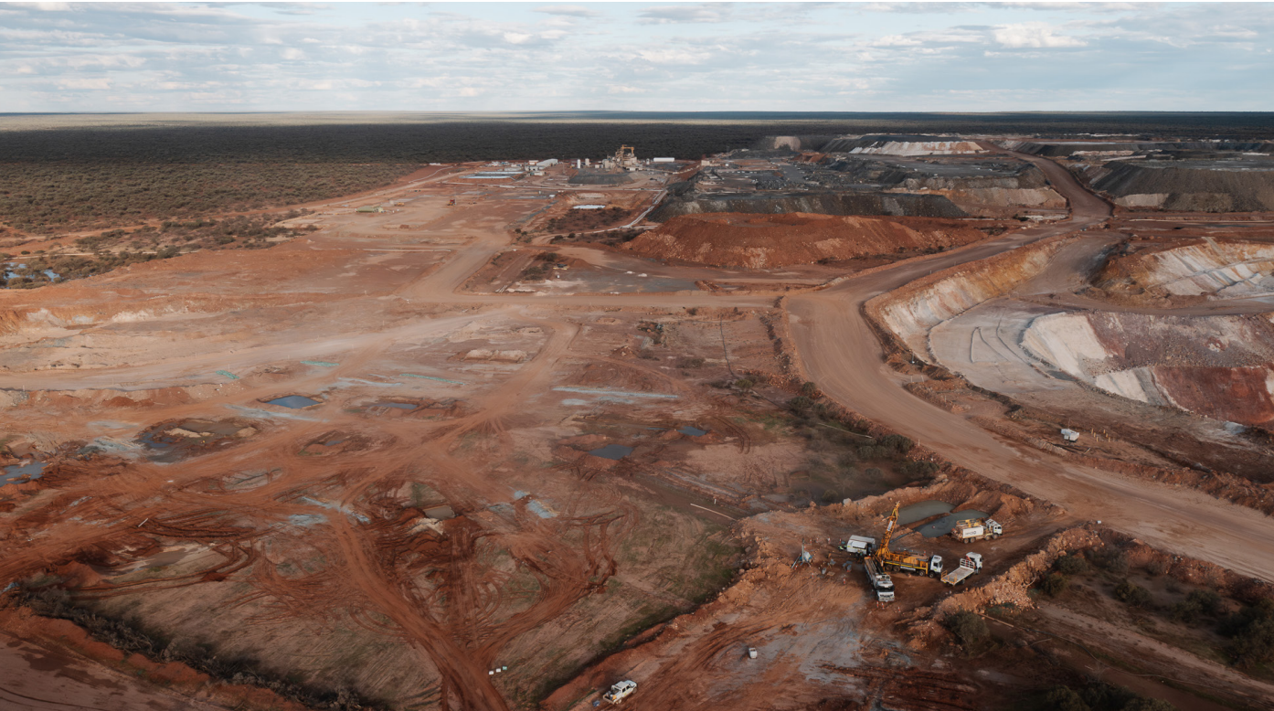
Aerial view over a portion of the Dalgaranga Project.

Economic performance underpins our ability to deliver operational and financial results for our stakeholders. Our aim is to deliver shared value through effective partnerships while maintaining balance sheet strength and flexibility to act on organic growth opportunities. In FY2024, the Company completed two successful placements and an entitlement offer to existing shareholders. The combined $105 million raised during the reporting period means we are well funded to execute the planned drilling programs, exploration decline and studies which will assist in allowing the Company to make a final investment decision for a production re-start at Dalgaranga. The communities near our sites experience the most direct social, environmental and economic impacts of our businesses. By prioritising local procurement and employment and contributing our share of taxes and royalties, we aim to support these local communities. During FY2024, Spartan contributed over $1.0 million to local community vendors in the Mt Magnet region. Within the Western Australia region, $43.9 million was contributed to payroll tax, WA royalties, tenement rent, shire rates, MRF, DEMIRS Mine Safety and Inspection Levy and WA suppliers.