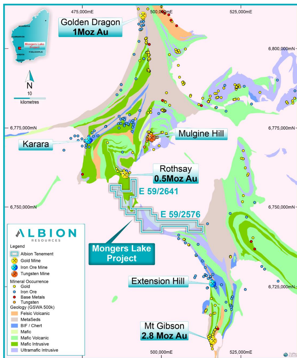
Figure 1: Mongers Lake Project Location Map on GSWA 500k Geology

The Mongers Lake Project covers a portion of the Yalgoo-Singleton Greenstone Belt in the Murchison Province of Western Australia, located between Capricorn Metals' Mt Gibson Gold Project and Silver Lakes' Rothsay Gold Projects (Figure 1). The Mongers Lake Project has been subject to limited historical exploration despite the regional prospectivity.