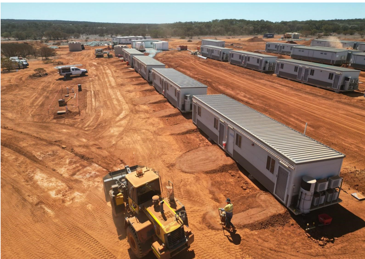
Figure 6: Drone image of progress at the accommodation village.