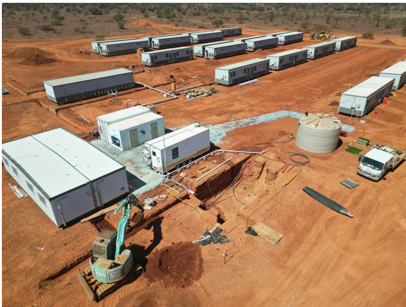
Figure 7: Drone image of progress at the accommodation village.