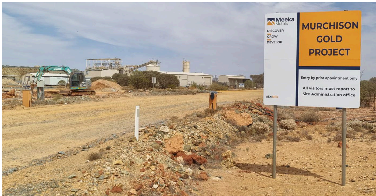
Figure 8: Preparation work for installation of the main administration complex is underway, installation will commence following completion of the accommodation village.