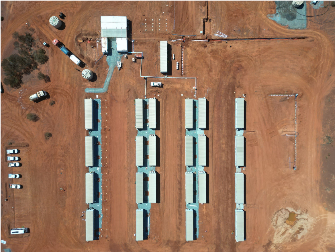
Figure 5: Drone image of the accommodation village. Construction progressing well with 88 rooms installed of a total of 136 rooms.