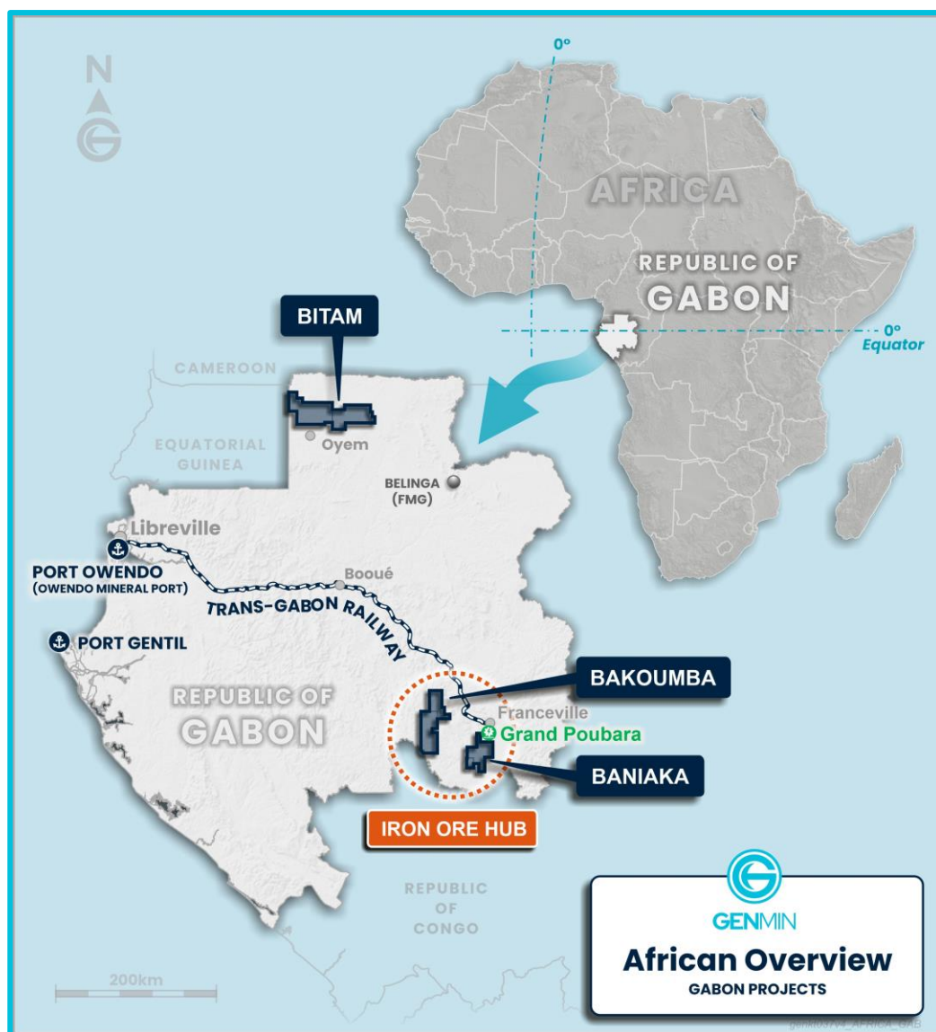
Figure 1: Location map of Genmin's projects in Gabon

The Company confirms that all material assumptions and technical parameters underpinning the estimates of Mineral Resources and Ore Reserves in the market announcement above continue to apply and have not materially changed, and that the form and context in which the Competent Persons findings are presented have not been materially modified.