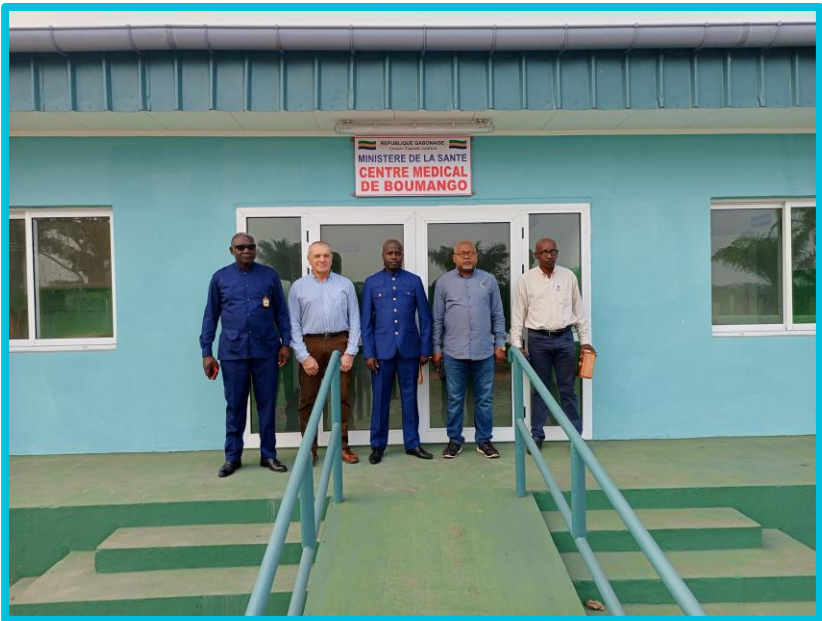
Figure 4: Handover of refurbished BMC to Ministry of Health and Boumango officials