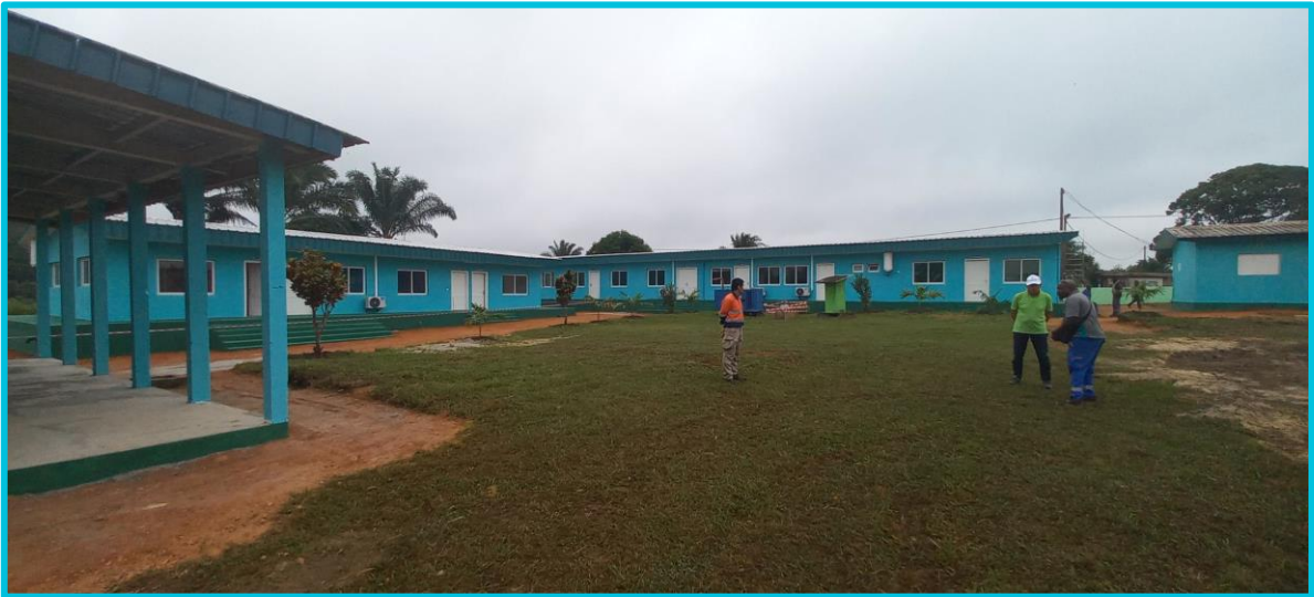
Figure 3: BMC after completion of refurbishment