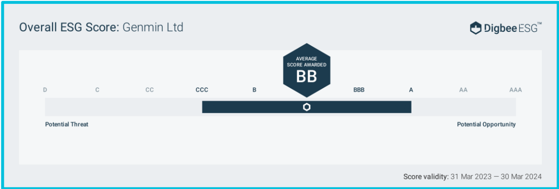
Figure 2: Inaugural Digbee score for Genmin corporate and Baniaka