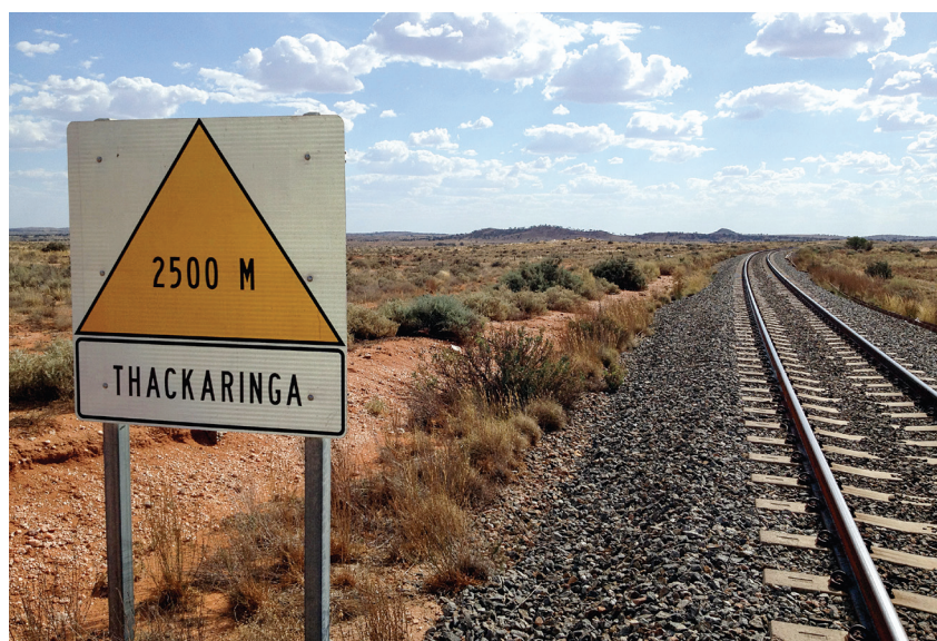
Pyrite Hill Deposit – as seen from Broken Hill – Port Pirie railway line