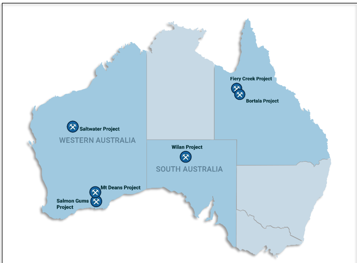
Figure 4: Aruma Resources project locations.

Aruma Resources Limited (ASX: AAJ) is an ASX-listed minerals exploration company focused on the exploration and development of a portfolio of prospective projects in high-demand commodities – copper and uranium - in world-class mineral belts, in South Australia and Queensland. It also holds gold, lithium and REE prospective projects in Western Australia