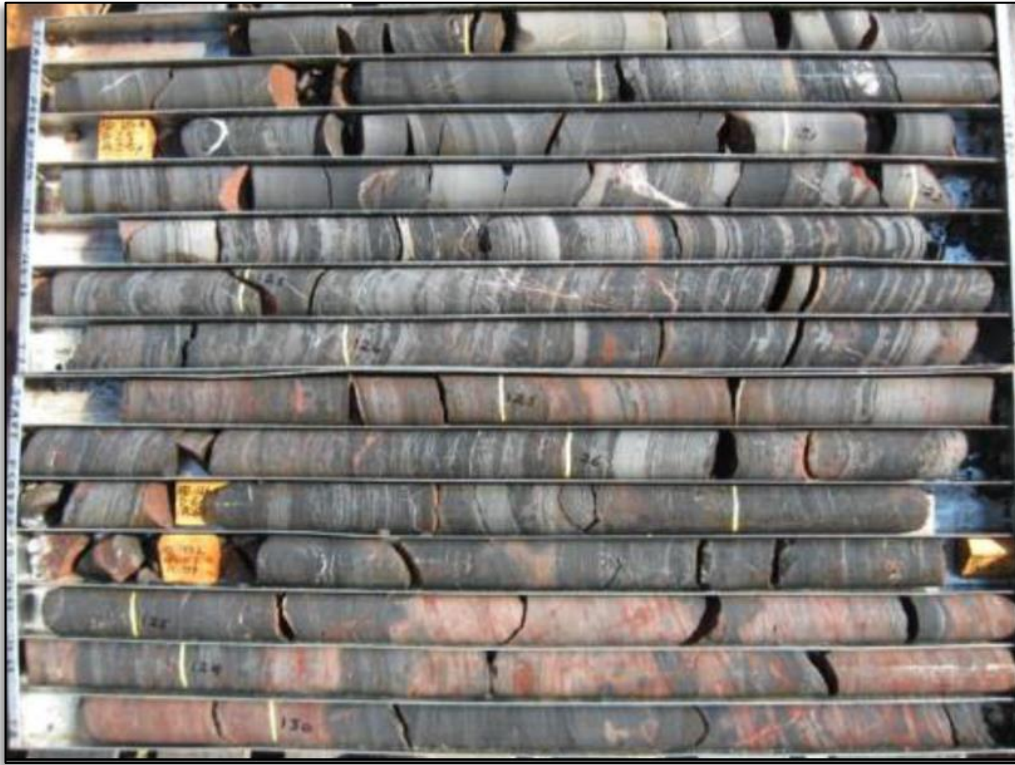
Figure 2: Red Rock (Hematite) Alteration in drill hole FC08DD010