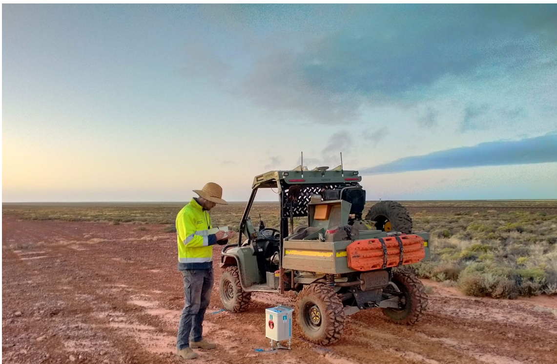
Photo Arcoona Gravity Surveying

"The Company is very excited to be commencing these surveys in a region well known for its world-class copper-gold endowment. The Arcoona tenement is one of the last exploration holdings in this region yet to be systematically gravity surveyed and as a consequence the 264km 2 of prime exploration land has also not been tested by a single exploration drill hole. We await the survey results with great anticipation."